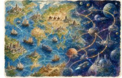
Trade routes — whether across Earth's oceans or a fictional galaxy — determine who controls goods, prices, and political power.

Explanation: At the Understand level, students move beyond simply recalling facts and begin to interpret and explain ideas in their own words. This lesson asks students to make sense of economic concepts by connecting them to familiar stories and real historical examples, building a deeper grasp of how economic decisions impact societies.