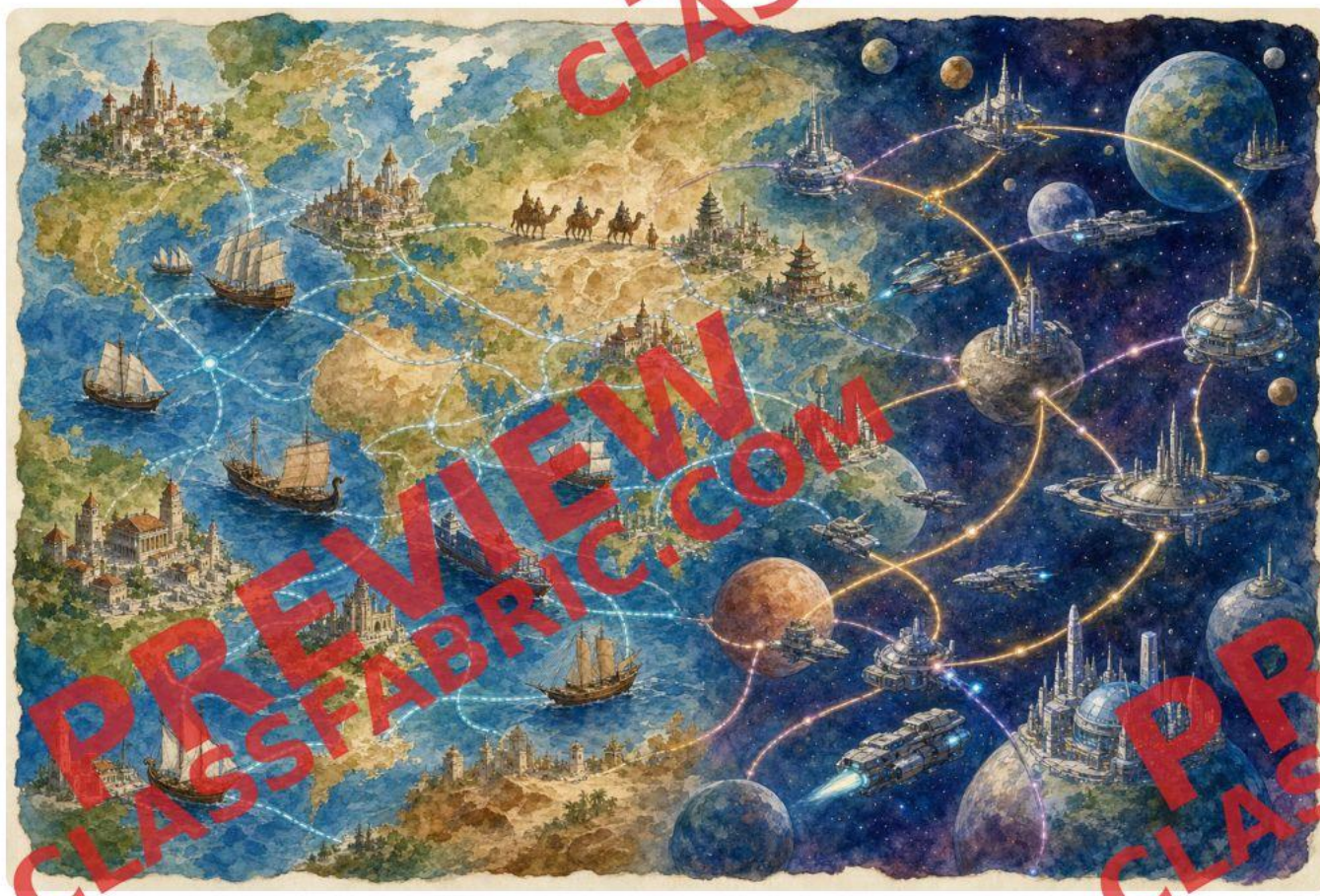
Trade routes — whether across Earth's oceans or a fictional galaxy — determine who controls goods, prices, and political power.