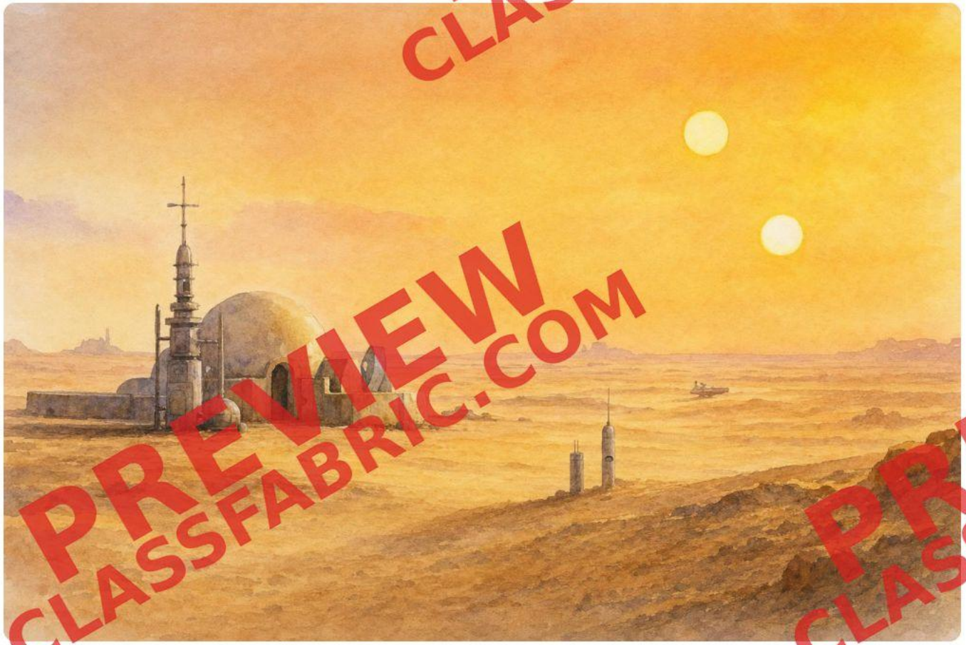
Moisture farmers on desert planets collect scarce water to survive — a vivid example of how scarcity shapes the value of resources in any economy.