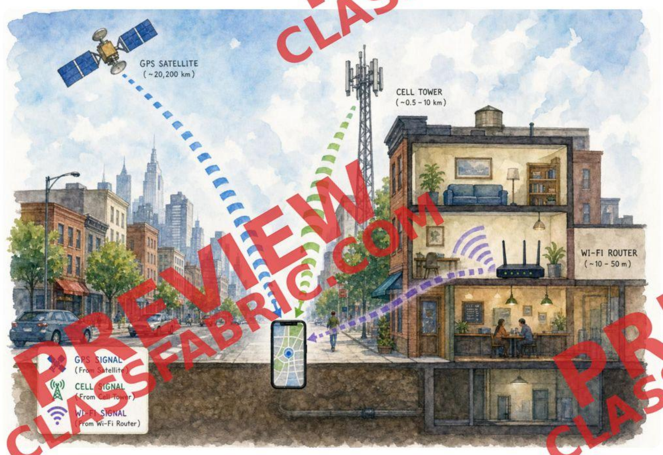
Your phone blends signals from satellites, cell towers, and Wi-Fi networks — each with different accuracy ranges — to find the most reliable location estimate.