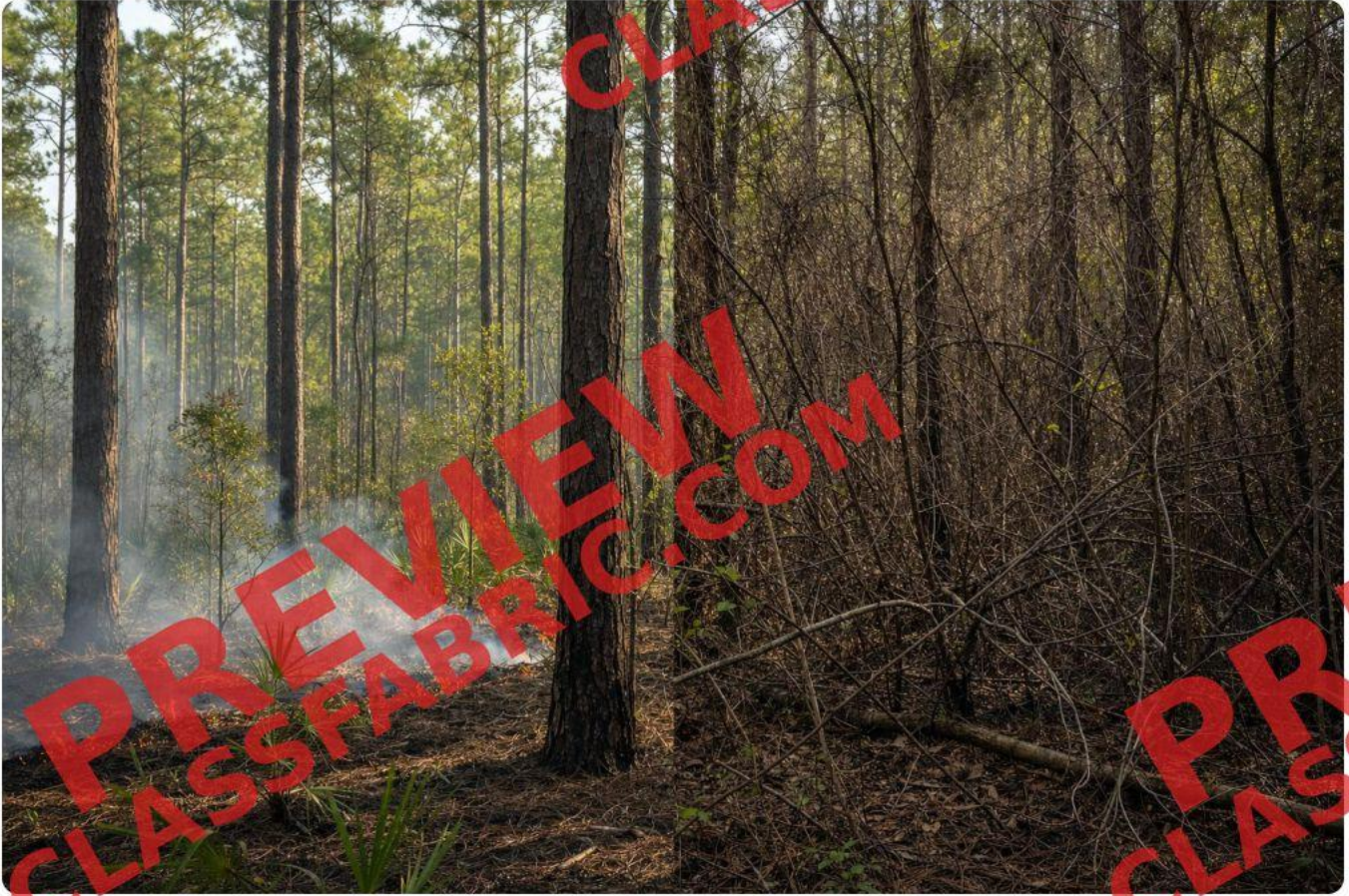
Comparing a forest managed with controlled burns to one with decades of fuel buildup helps explain why some wildfires are far more destructive than others.