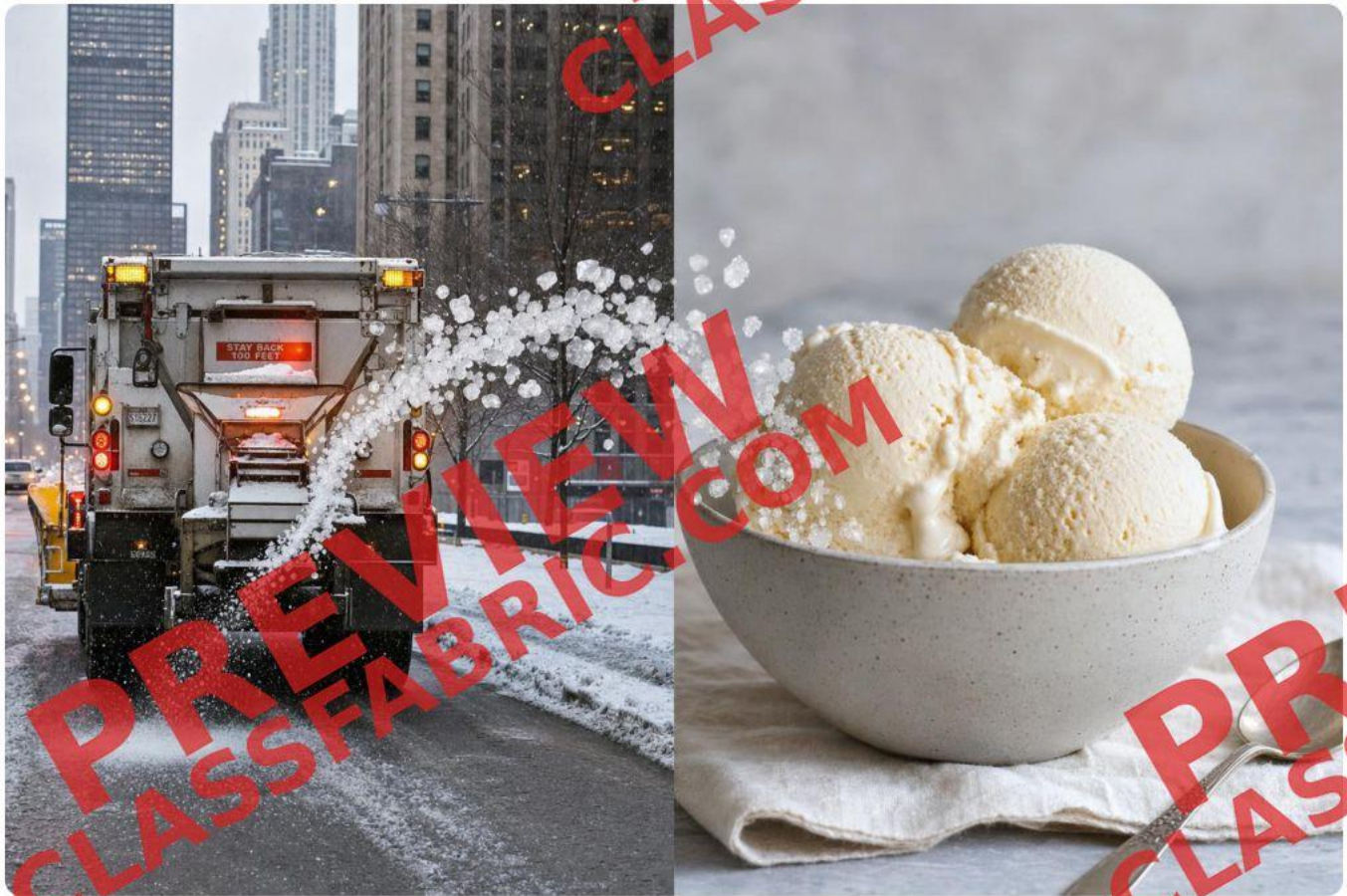
The same chemistry that keeps roads ice-free in winter is what turns a bag of cream and ice into a frozen dessert — freezing point depression at work.