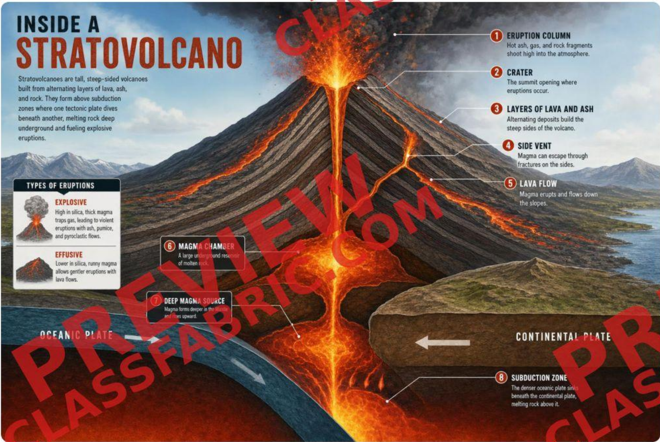
A stratovolcano eruption begins deep underground, where magma builds pressure before exploding through Earth's crust — connecting the geosphere to the atmosphere above.