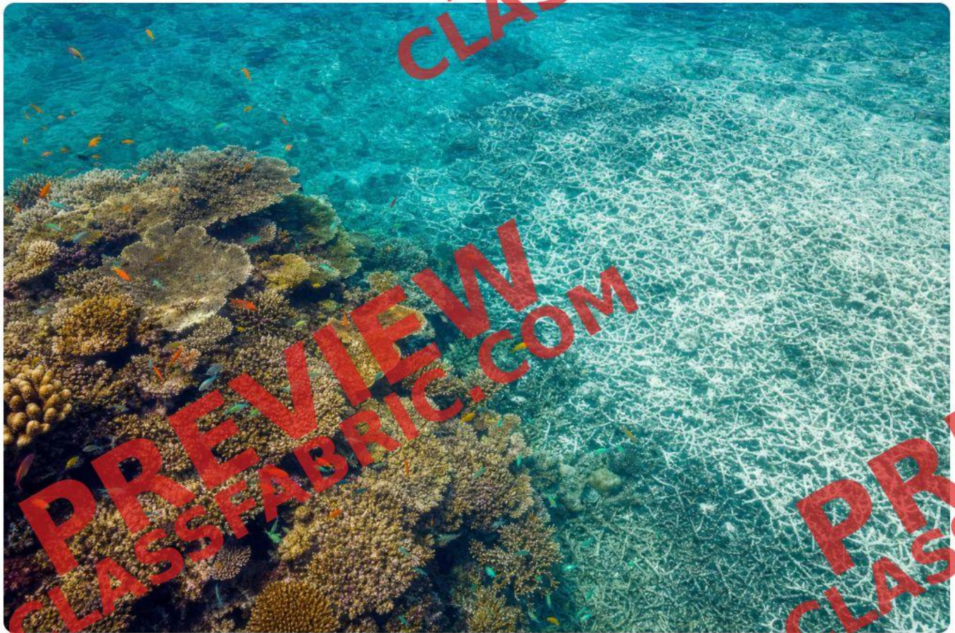
Coral bleaching turns once-colorful reefs ghostly white. Prolonged bleaching kills reefs that support roughly 25% of all marine species.