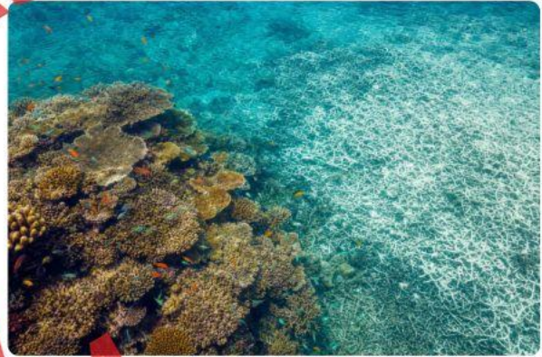
Coral bleaching turns once-colorful reefs ghostly white. Prolonged bleaching kills reefs that support roughly 25% of all marine species.

shapes your daily life in ways you probably never noticed. The air you breathe, the weather outside your window, and the food on your plate are all connected to the vast blue world that covers more than 70% of our planet. On World Oceans Day, celebrated every June 8th, scientists and communities around the globe pause to reflect on just how essential — and how fragile — that connection really is.