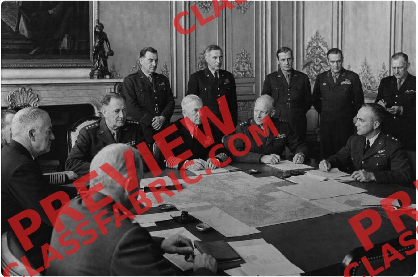
Allied leaders met at conferences like Yalta and Potsdam to negotiate the future of postwar Europe — decisions that would shape the next half century of world history.