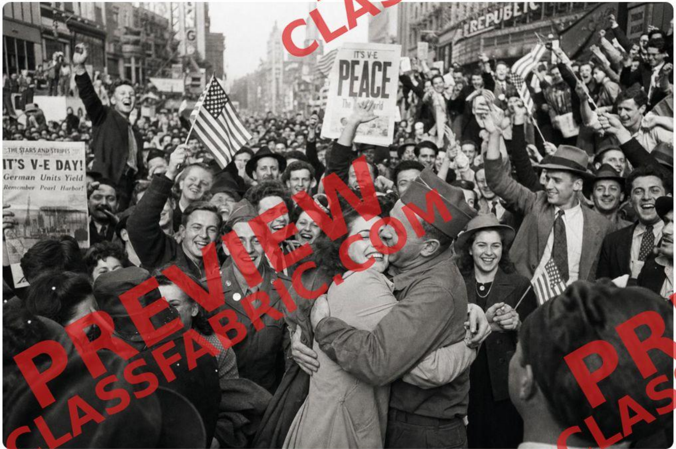
On May 8, 1945, people across Europe and North America flooded the streets to celebrate the end of World War II in Europe, known as V-E Day.