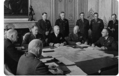
Allied leaders met at conferences like Yalta and Potsdam to negotiate the future of postwar Europe — decisions that would shape the next half century of world history.

Explanation: The Understand level of Bloom's Taxonomy asks students to go beyond memorizing facts and instead interpret and explain what historical events mean. In this lesson, students will make sense of complex events — like the fall of Nazi Germany, the Holocaust, and the origins of the Cold War — by connecting them to each other and to the broader story of World War II.