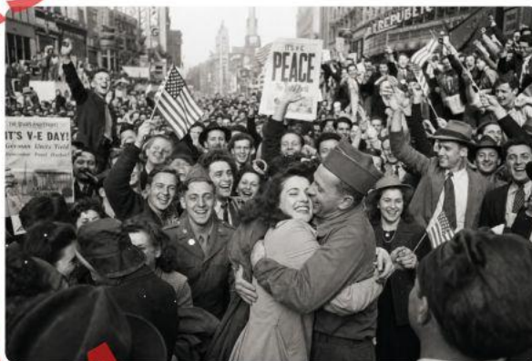
On May 8, 1945, people across Europe and North America flooded the streets to celebrate the end of World War II in Europe, known as V-E Day.

Paris, New York, and Moscow, weeping and cheering at the same time. This was Victory in Europe Day — V-E Day — one of the most significant moments of the twentieth century. But how did the world arrive at that moment, and what did it mean for the future? To truly understand V-E Day, we need to examine the final collapse of Nazi Germany, the horrifying discoveries Allied soldiers made along the way, and the difficult decisions world leaders made about what would come next.