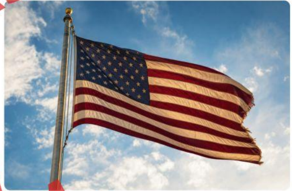
The American flag's 50 stars represent each state, while the 13 stripes honor the original colonies that declared independence in 1776.

Imagine standing in a crowded stadium as the national anthem plays. Thousands of people turn their eyes to the same object — a rectangular piece of fabric with red and white stripes and a field of white stars on blue. Some people place their hands over their hearts. Some sing loudly. Some feel a lump in their throats. How did a simple arrangement of colors and shapes come to carry so much emotional power? That question is at the heart of Flag Day, celebrated every June 14th, and it connects directly to how all cultures create and share meaning through symbols.