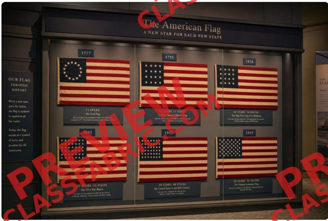
As new states joined the Union, new stars were added to the flag. This is how the same symbol can change over time while keeping its core meaning.