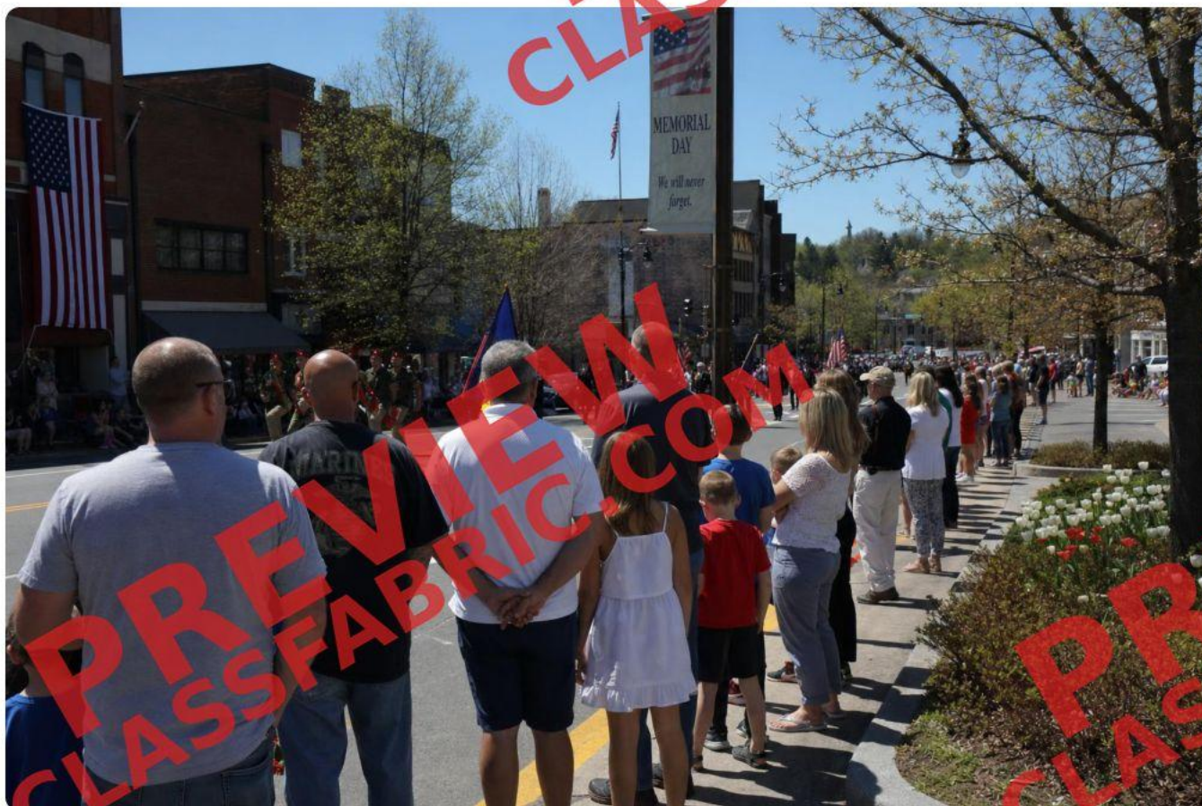
Communities across the United States hold Memorial Day ceremonies each year to honor and remember those who gave their lives while serving in the military.