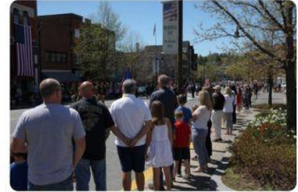
Communities across the United States hold Memorial Day ceremonies each year to honor and remember those who gave their lives while serving in the military.

Explanation: At the Understand level, students move beyond simply recalling facts to making sense of what those facts mean. Here, students will interpret the causes and effects behind Memorial Day's creation and put the holiday's significance into their own words.