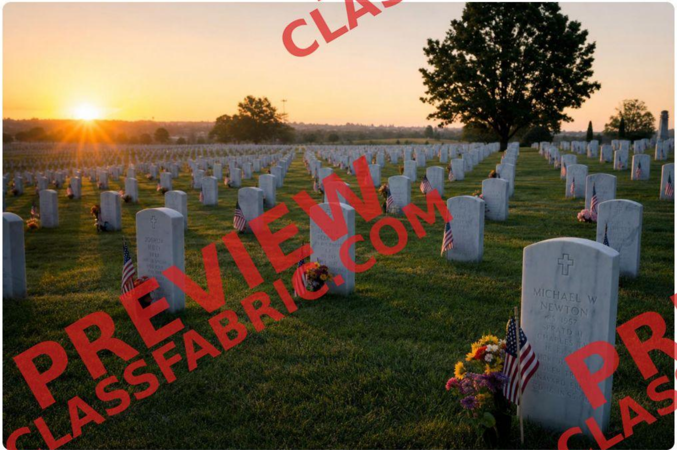
On Memorial Day, American flags and flowers are placed on the graves of soldiers who died in military service — a tradition dating back to the Civil War era.