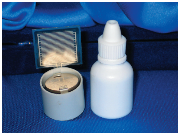
Figure 1 Monitoring device and conventional 5 ml eye drop bottle.

According to the manual and electronic protocols all applications with bottles kept in the fridge before application were identified correctly. After the trial all devices were observed until the battery was exhausted. The observed battery lifetime for the used compliance monitors exceeded 60 days.