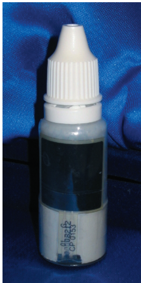
Figure 3 Monitoring device mounted under commercial eye drop bottle.

The main disadvantages of the methods described were limited usability because of the bulkiness of the devices, complete data loss in case of an empty battery, high cost at the time of presentation, and the fact that the patient was aware of recordings because of the different handling of the compliance monitor compared to a normal bottle. The