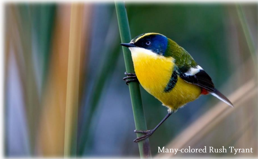
Many-colored Rush Tyrant

Day 7: AM Birding and transfer to Gramado (+/-4hrs [300km]).