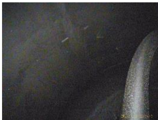
Photo 2 Description: Absorber bottom coil, inside the bottom section of the tower.