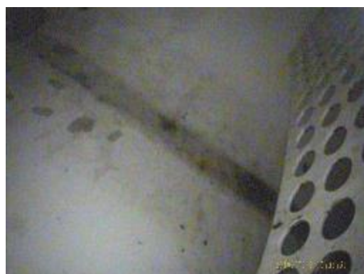
Photo 11 Description: Separator bottom weir located right of boot.