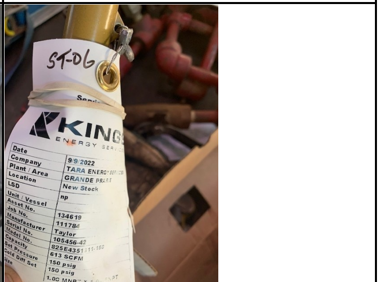
PSV Service Tag