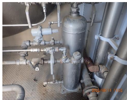
Overall view of Equipment