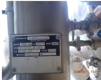
View of Nameplate