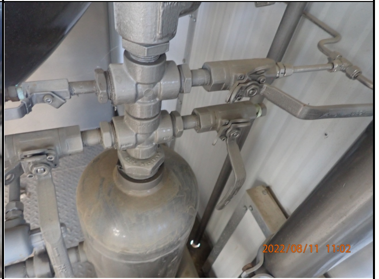
Gas Outlet Piping