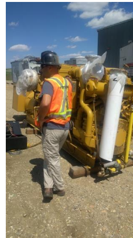
Finning technician inspecting Generator #1