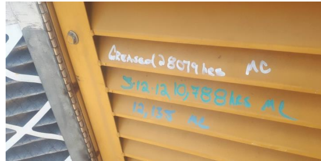
Last maintenance done @ 12,135hrs