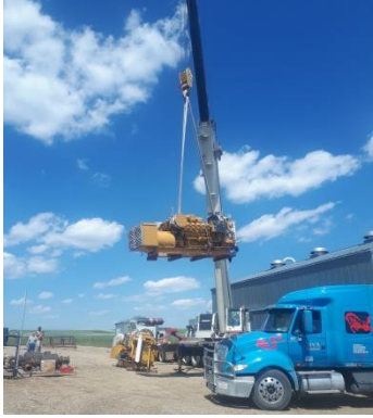
Generator #2 being lifted into place