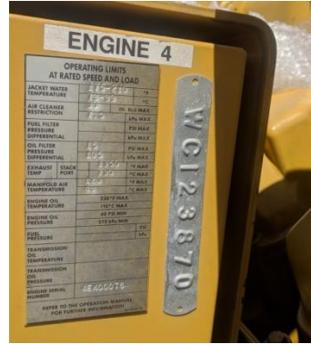
Generator #2 (Engine 4) – E4K00076