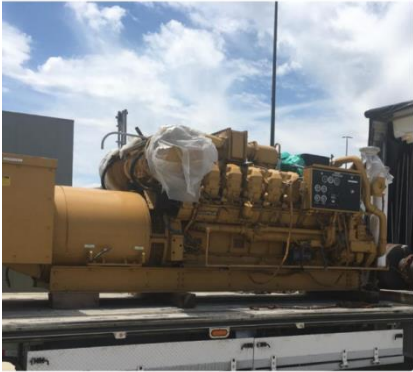
Generator 1 on the truck