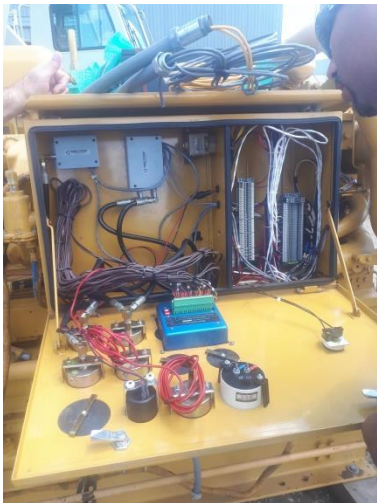
Control panel Generator #1