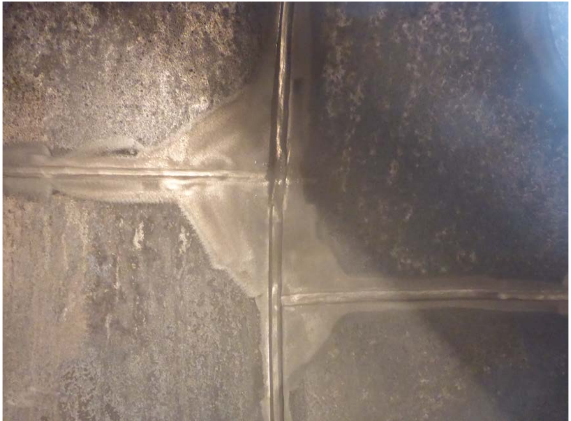
South Head to Shell Weld