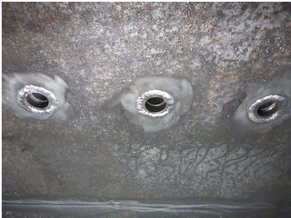
PSV Nozzles at 12 o'clock