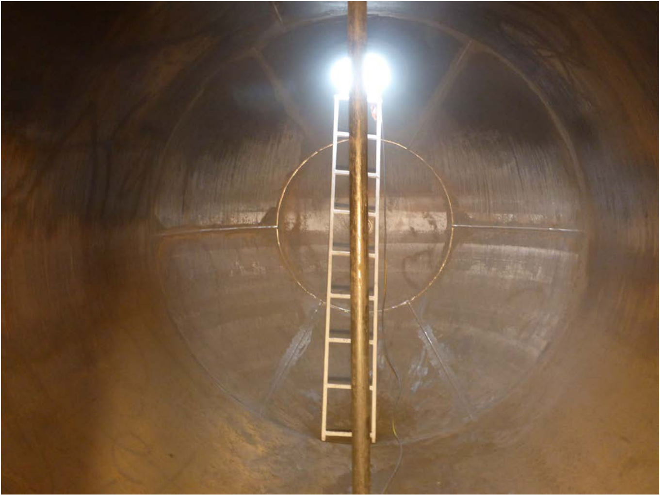
View toward the South (Entry) Head