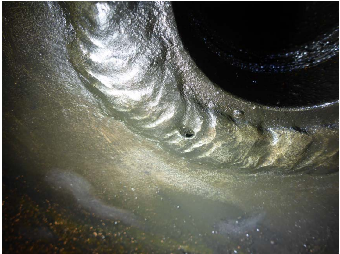
Pit found in a PSV Nozzle weld exceeding the minimum thickness allowed.