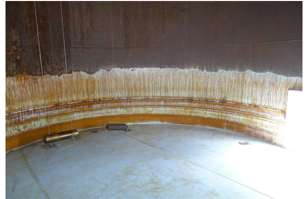
Internal shell/floor - note two level floats