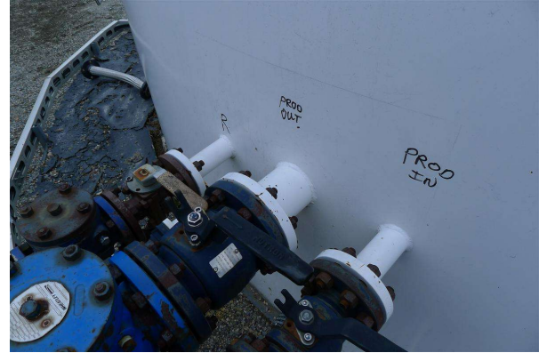
Nozzles - note lack of repads