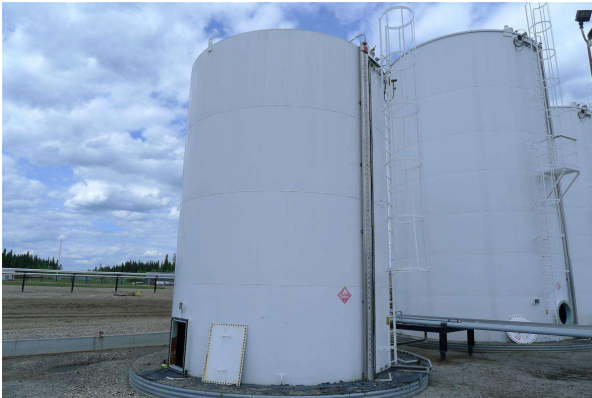
Overall view - note ladder and level gauge