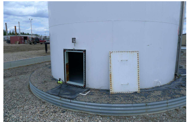
Manway and door - note foundation and leak detection