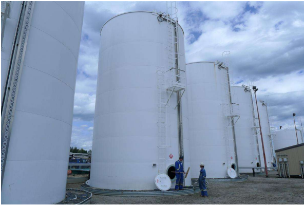
Overall view - note ladder and level gauge