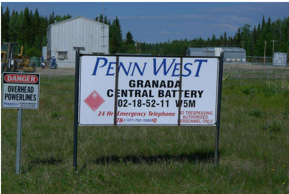
Plant Lease Sign