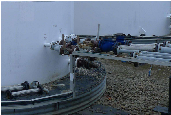
Piping - note removed bellows