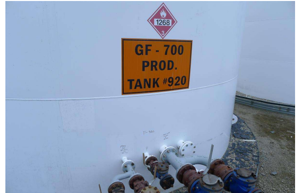
Nozzles and tank labeling - note lack of repads