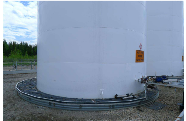
Lower tank - note foundation, leak detection, and layer of tar