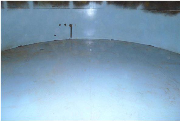
Internal shell/floor - note nozzles