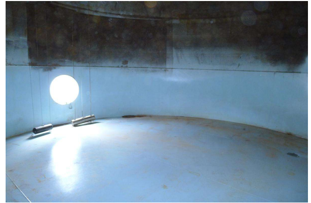
Internal shell/floor - note two level gauges, one in front of manway