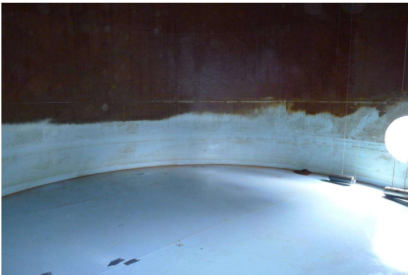
Internal shell/floor - note two level floats, one in front of manway