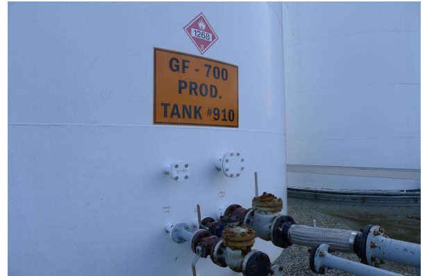
Piping and tank labeling - note disconnected bellows