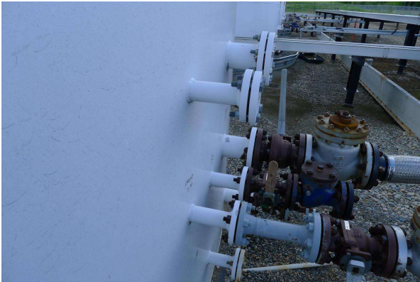
Nozzles - note lack of repads