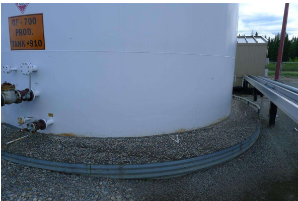
Bottom of tank - note foundation and leak detection