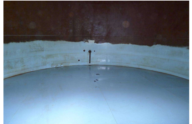
Internal shell/floor - note nozzles