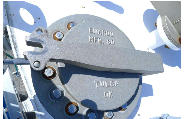
Top of thief hatch (unfastened)