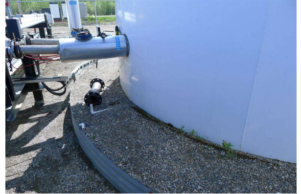
Lower shell - note leak detection and vegetation