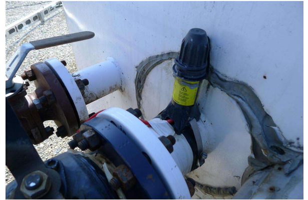
Close up of nozzles - note lack of repairs