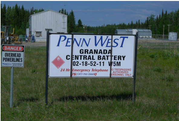
Plant Lease Sign