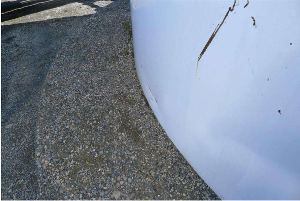
NW shell - note dent and scrapes in coating