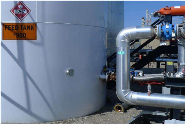
Piping - note removed bellows