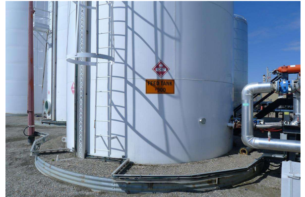
Lower tank - note ladder, level gauge, and labeling