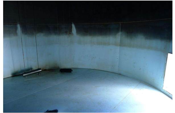
Internal shell/floor - note level floats