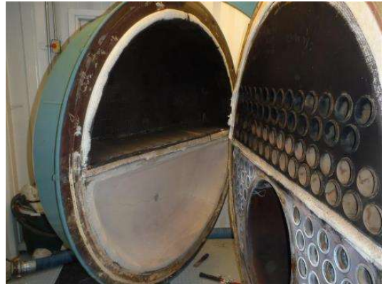
Rear Door / Tube Sheet