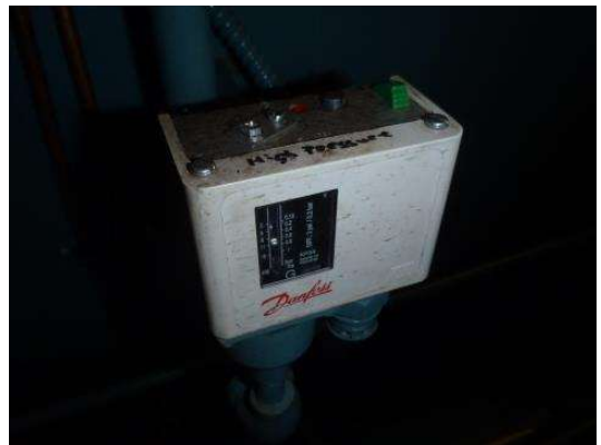
High Pressure Cut Off Switch