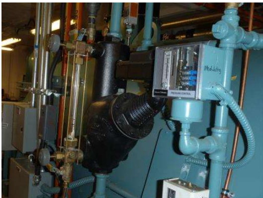
Boiler Low Water Cutoff Valve