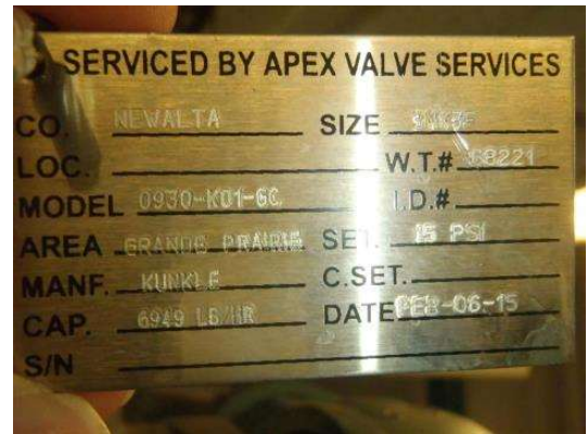
PSV Service Tag