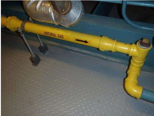
Fuel Gas Piping