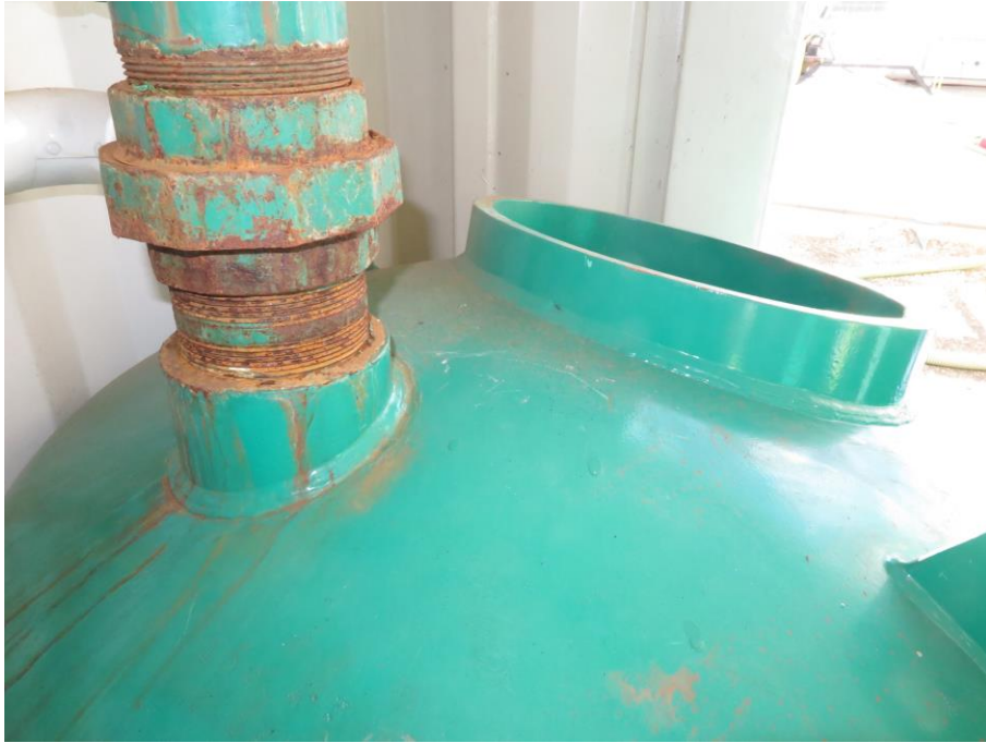
Top head and nozzle welds