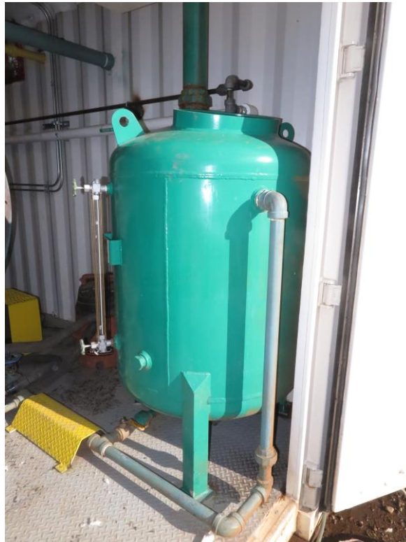
Shell and base