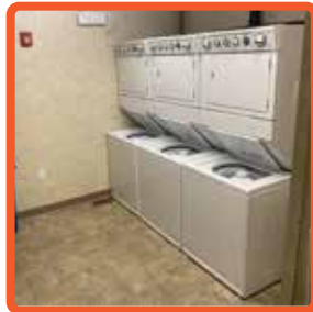
Shared Laundry Room