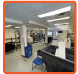
Shared Laundry Room