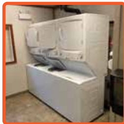
Shared Laundry Room