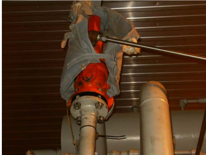
06 PSV overview