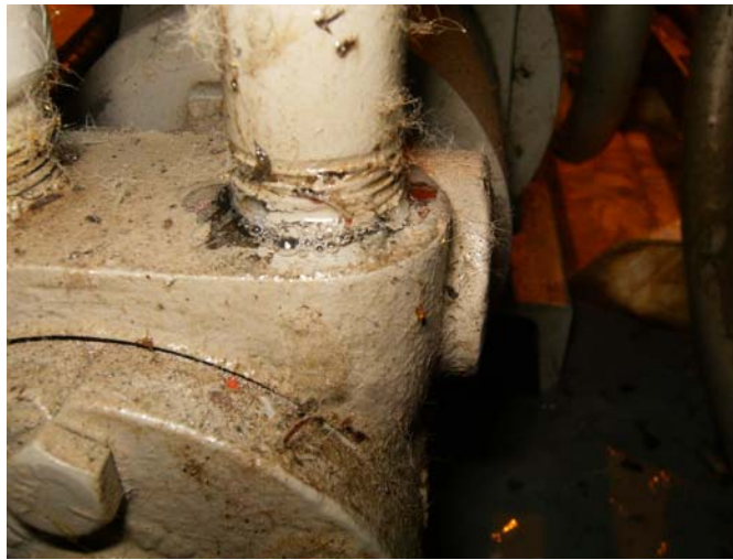
05 leak on pump