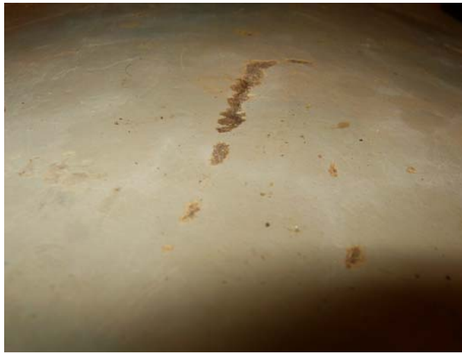
03 chipped coating