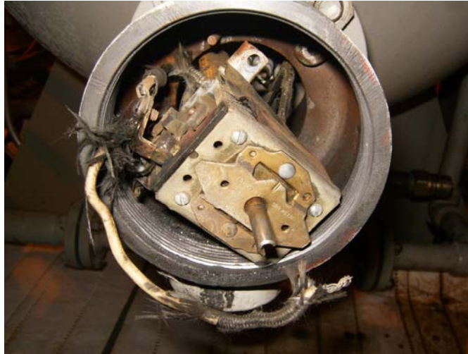
04 broken instrumentation