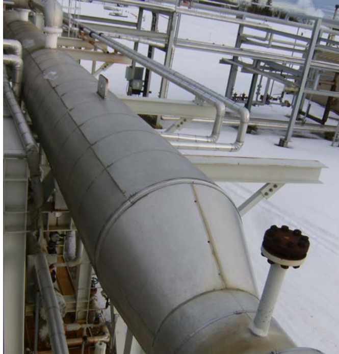
03 West overview