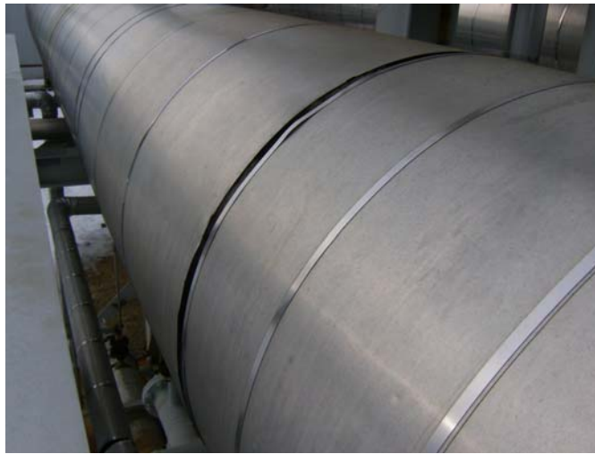
07 loose banding