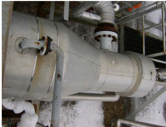
02 East overview