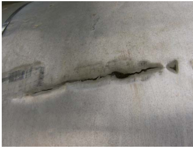
05 punctured cladding with moss