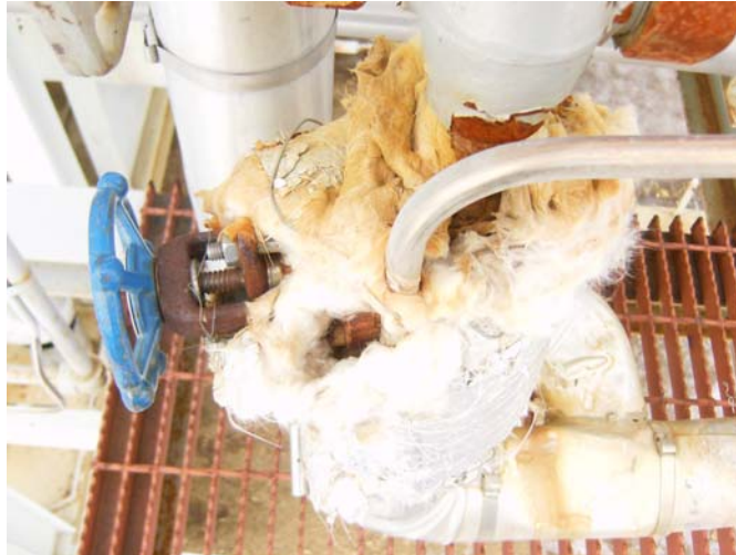
06 deteriorated insulation