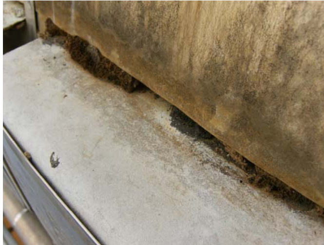
08 moss growth around nameplate