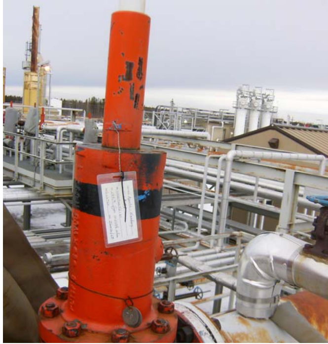
09 PSV overview