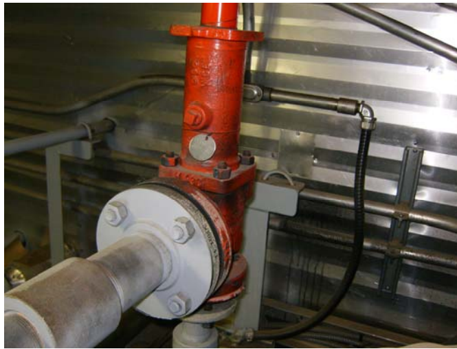
03 PSV overview