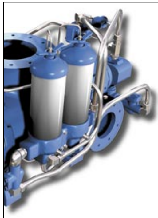
The RG282M and RG357M's unique oil system includes a reliable female rotor-driven oil pump. As an option, the compressors accommodate existing oil systems with a single-point connector.