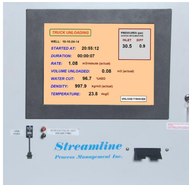
Truck Operator Interface