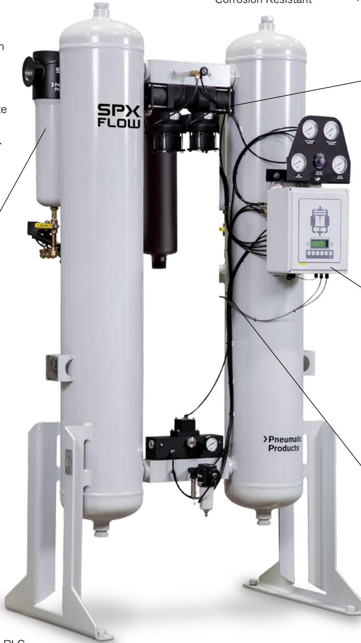
*Model Shown with Optional Features