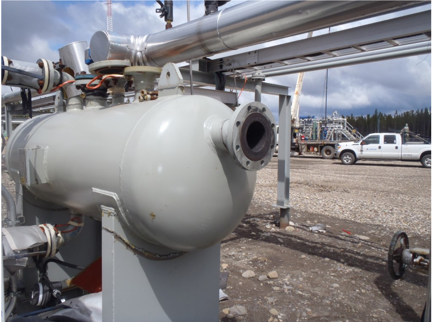
Outlet Nozzle Side