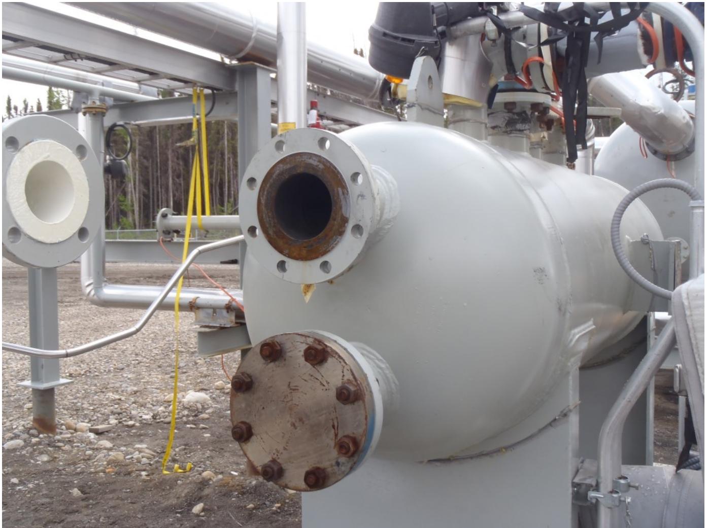
Inlet Nozzle Side