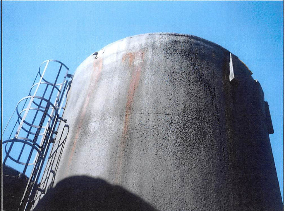
Rusty seepage evident, possible sign of Corrosion Under Insulation in area - monitor roof level.