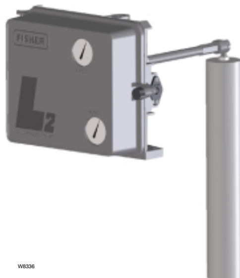
Figure 2. Type L2 Liquid Level Controller

The rugged Type L2 liquid level controller uses a displacer type sensor (see figures 1 and 2) to detect liquid level or the interface of two liquids of different specific gravities. This controller is ideal for controlling level on gas separators and scrubbers. The reliability of the Type L2 design makes it well suited for high pressure liquid level applications in natural gas production, compression, and processing. The device delivers a pneumatic output signal to a control valve. The sensor uses a threaded 2-inch NPT connection to the vessel.