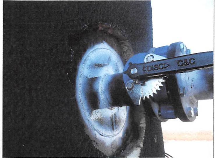
4" Nozzle & Repad