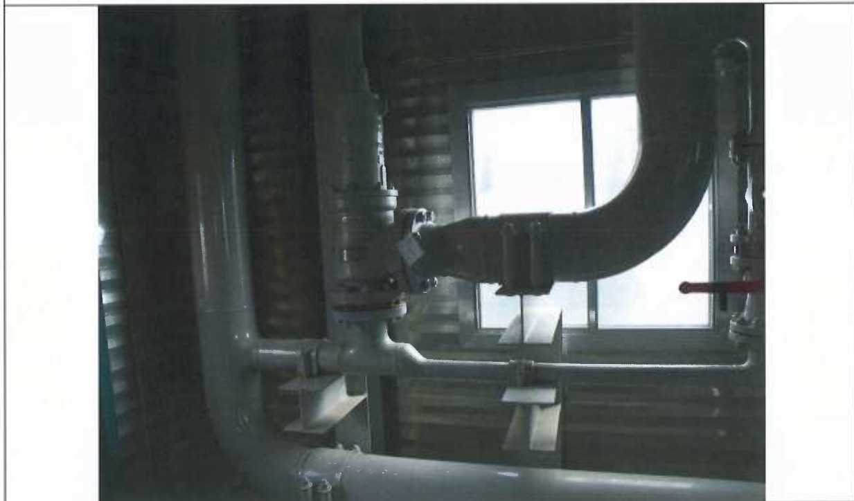
General View of the PSV