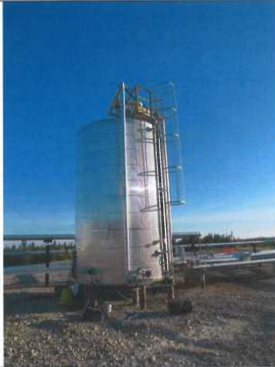
General external view of the storage tank