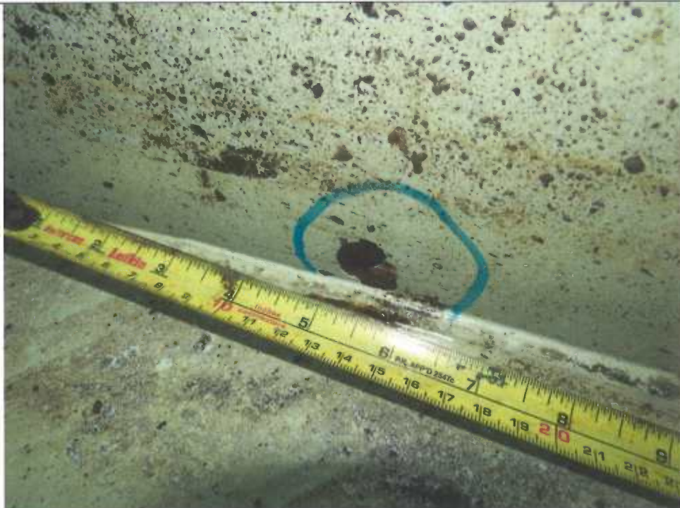
Isolated areas of coating damage along the bottom shell