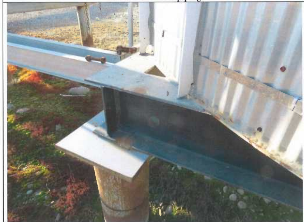
General view of the tank support system