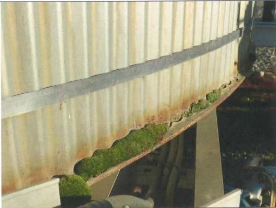
Areas of moss growing along the bottom of the insulation cladding