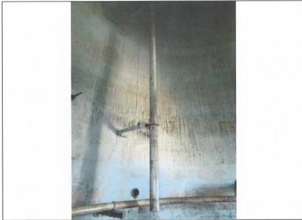
Internal overflow piping