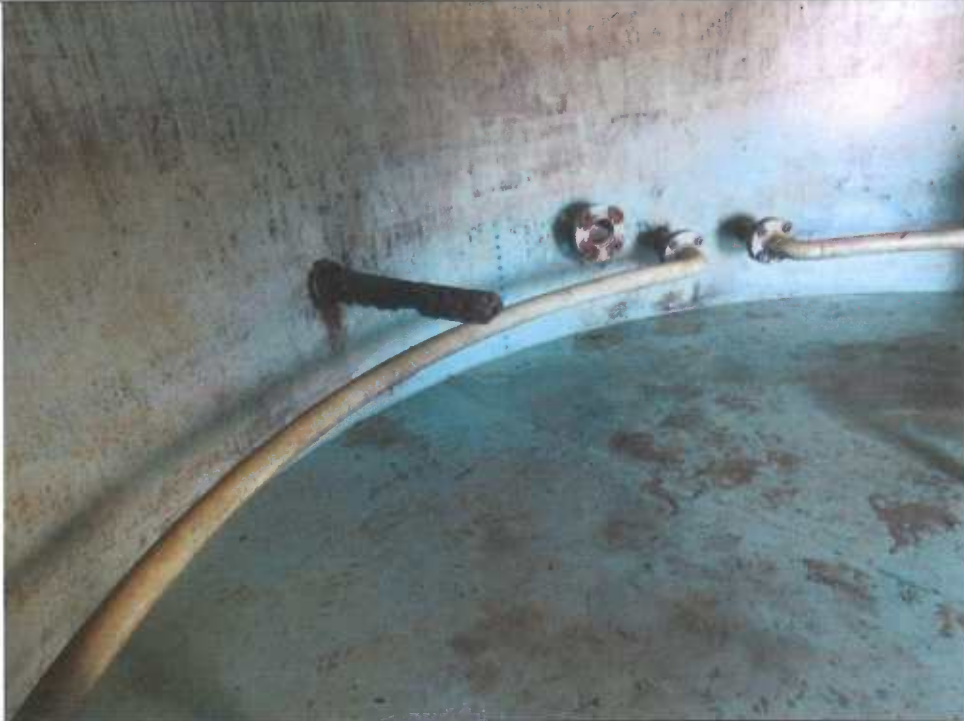
General internal view of the floor and lower shell