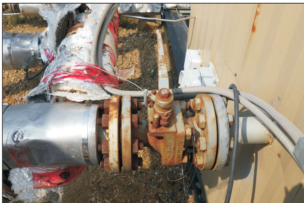
OUTLET SPEC BLIND PRESENT