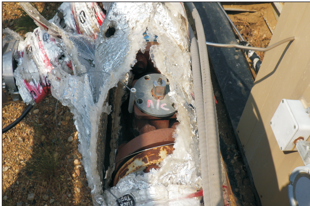
INLET SPEC BLIND PRESENT