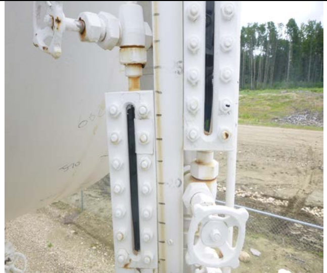
Level Gauge Condition – Level readable at bolt 21.