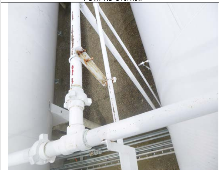
Small bore piping – Hammer unions & U-Bolts missing.