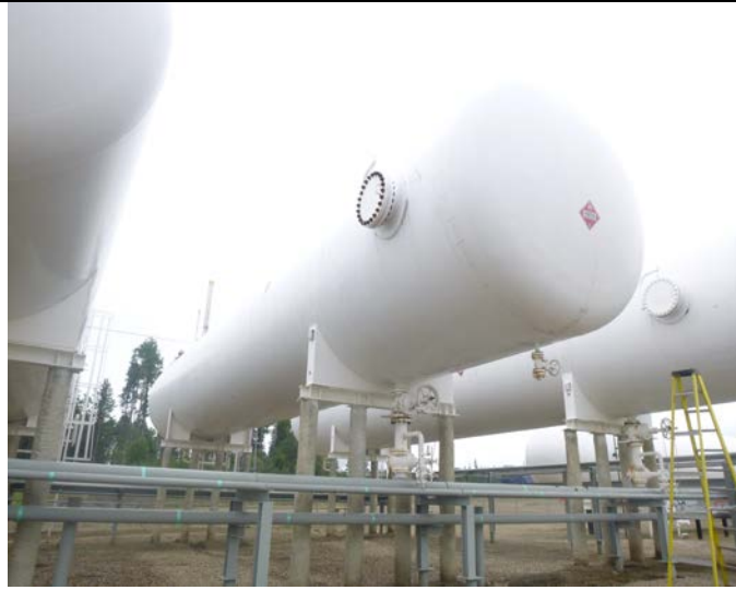
Manway – North East side. Davit arm to clevis attachment needs to be double nutted.