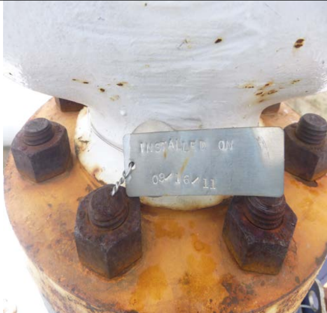
Example of fasteners and attachment oxidation.