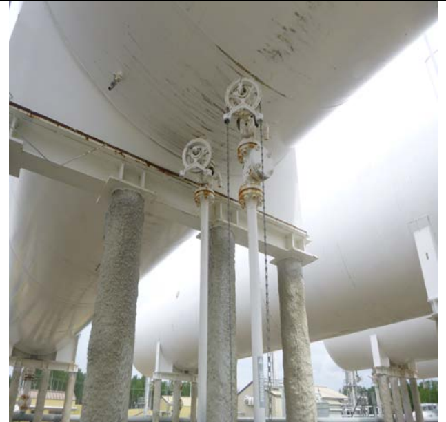
Small bore piping – Manual chain missing on one valve on south end and condition of fireproofing.