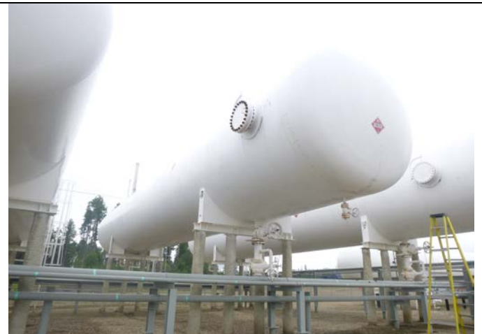
Overview of vessel – looking south west