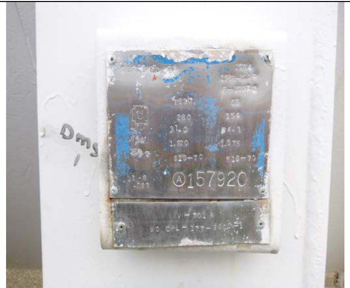
Vessel Data Plate