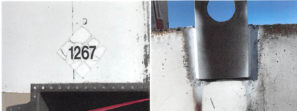
- Typical Lifting Lug

Requisitioner: Kristy Leeson Approver: Glen King 22-02003834 S/N: D-03-125S1