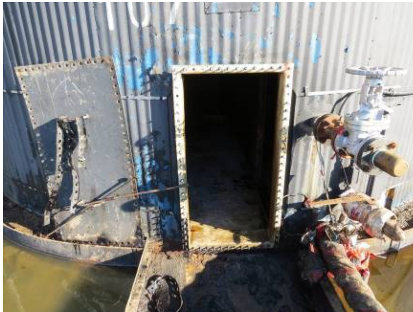
Photograph #20: Manway

The following digital photographs of the nozzles and appurtenances were taken at the period of this inspection: