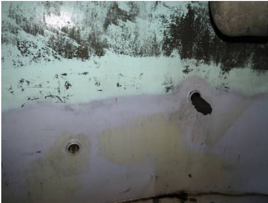
Photograph #29: Internal Nozzles