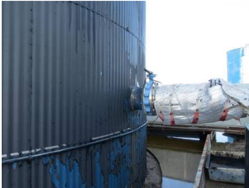
Photograph #22: Nozzle