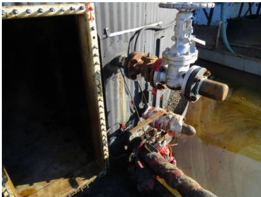
Photograph #21: Nozzles