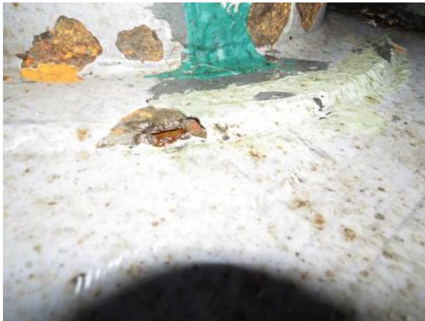
Photograph #9: Center Column Reinforcing Pad Corrosion