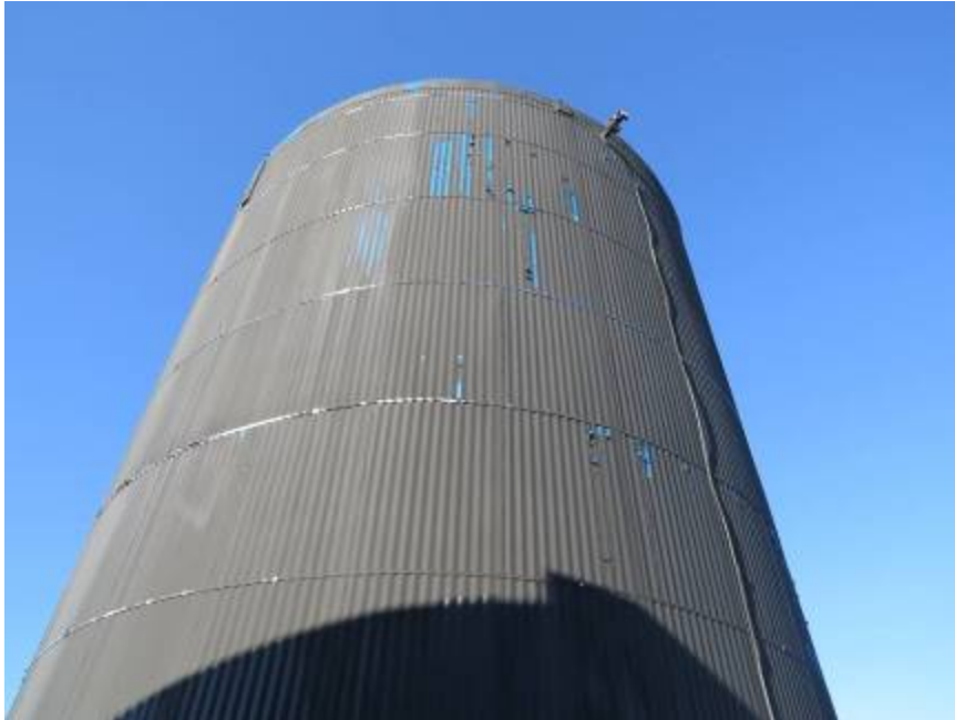
Photograph #16: External Shell Overview

The following digital photographs of the shell were taken at the period of this inspection: