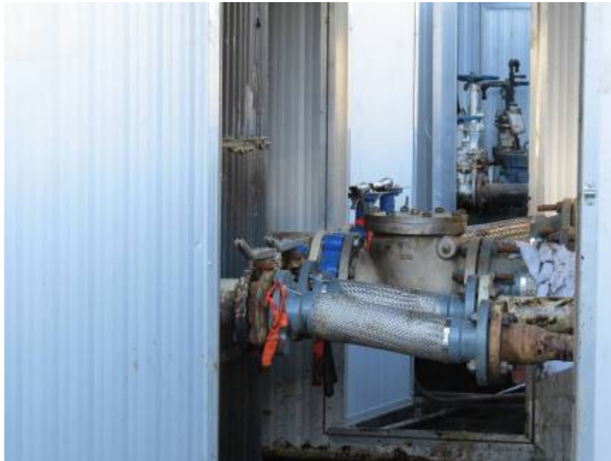
Photograph #24: Nozzles