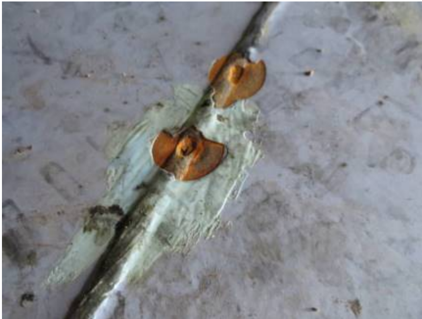
Photograph #11: Bottom Plate Weld Corrosion