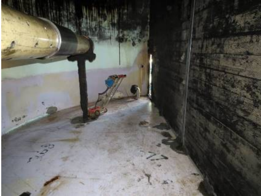
Photograph #6: Bottom Plate Overview

The following digital photographs of the bottom were taken at the period of this inspection: