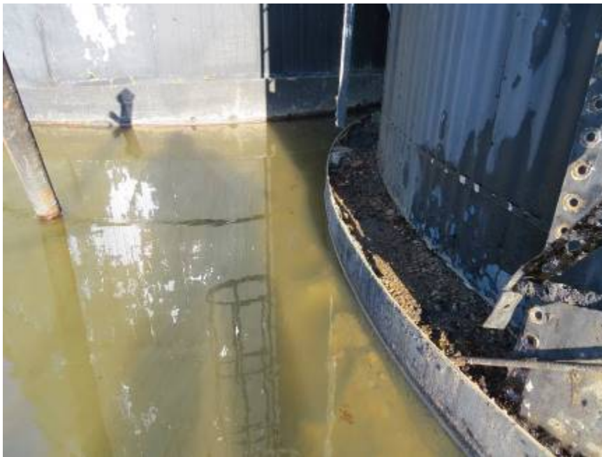
Photograph #14: Foundation Overview