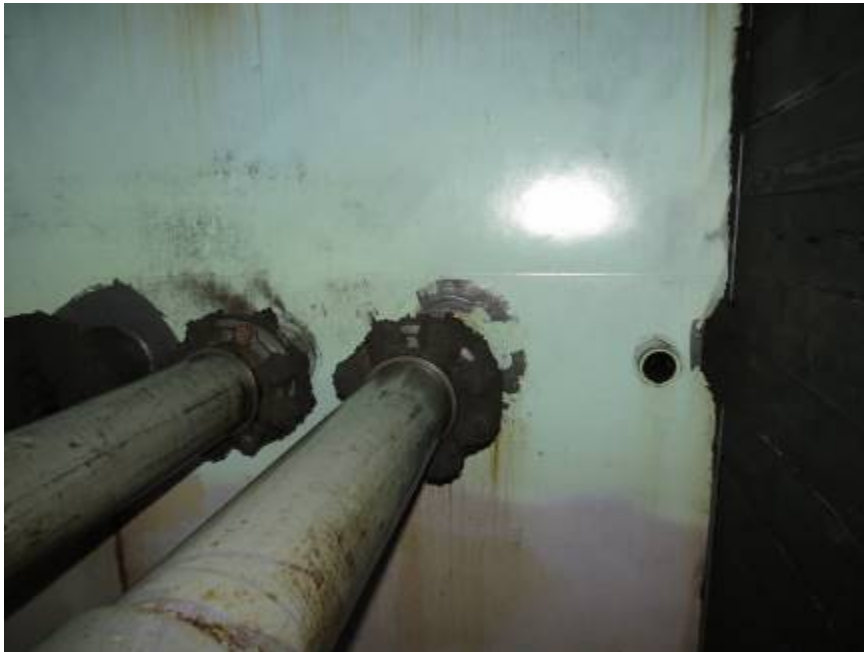
Photograph #31: Internal Nozzles