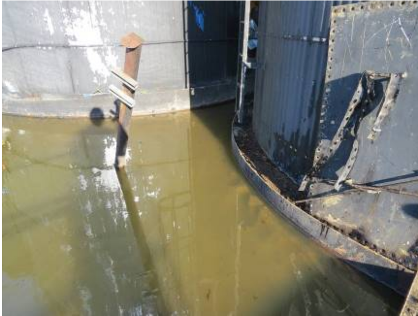
Photograph #13: Foundation Overview

The following digital photographs of the foundation were taken at the period of this inspection: