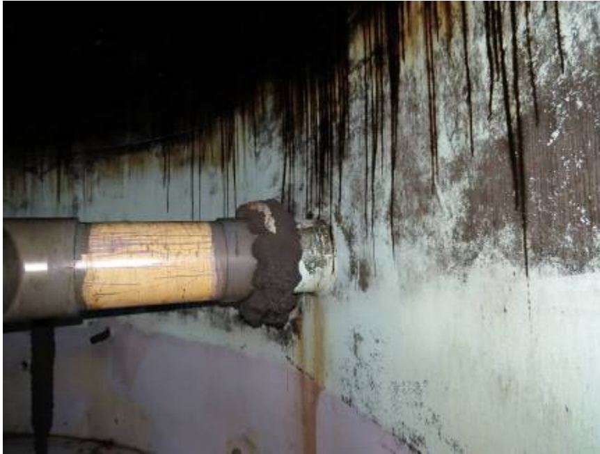
Photograph #28: Internal Nozzle