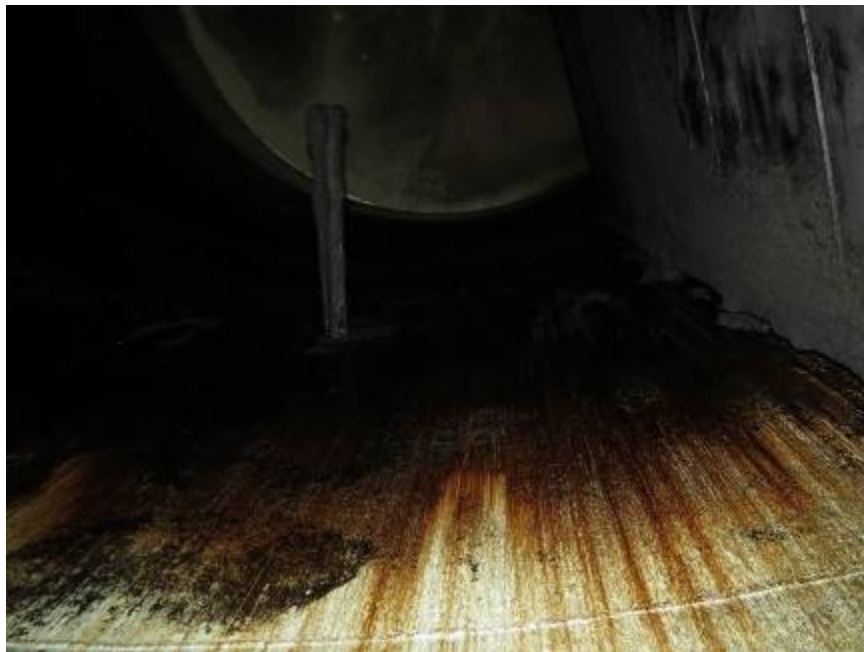
Photograph #19: Internal Shell Overview