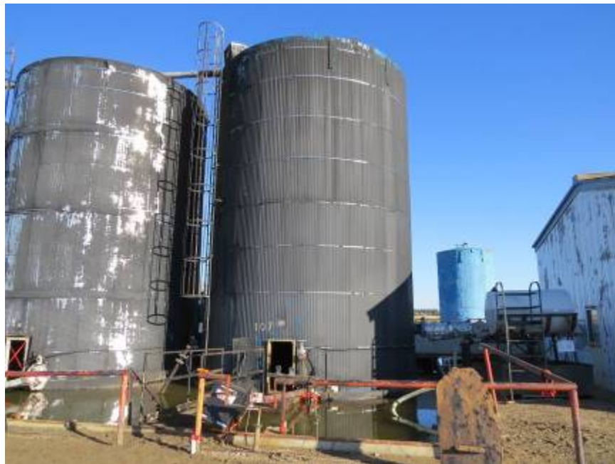
Photograph #4: Tank Overview