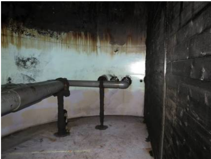
Photograph #7: Bottom Plate Overview