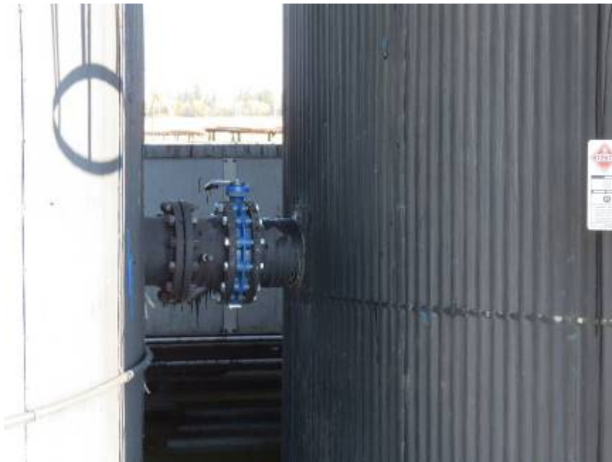
Photograph #25: Nozzle