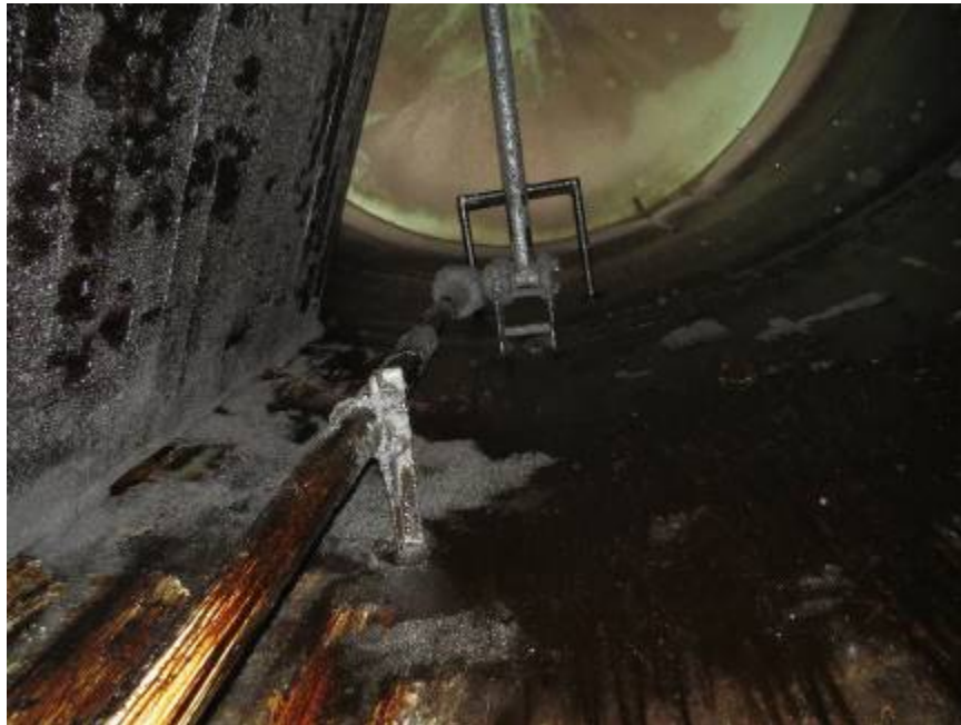
Photograph #18: Internal Shell Overview