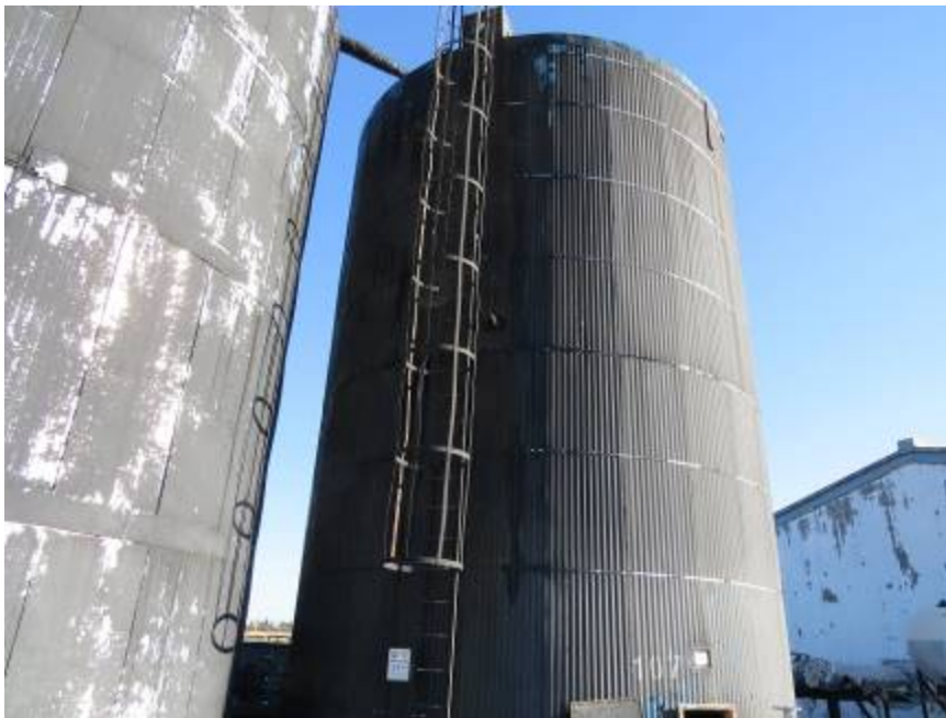
Photograph #17: External Shell Overview