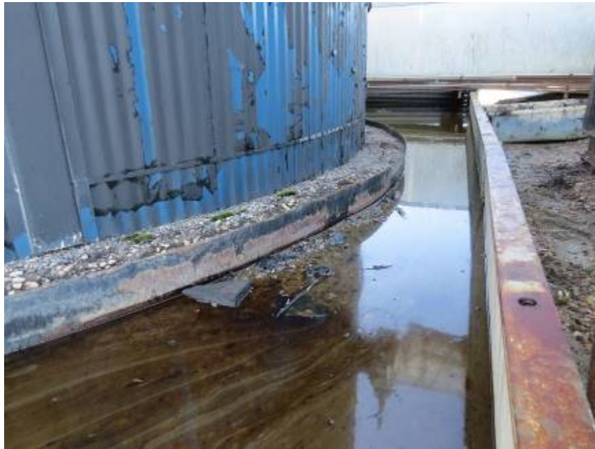
Photograph #15: Foundation and Berm Overview – Full of Water