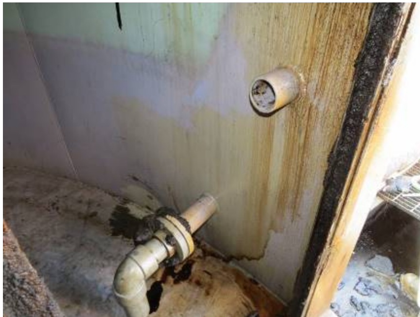
Photograph #27: Internal Nozzles