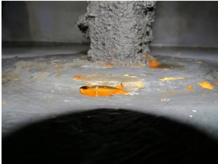
Photograph #36: Pipe Support Reinforcing Pad Corrosion