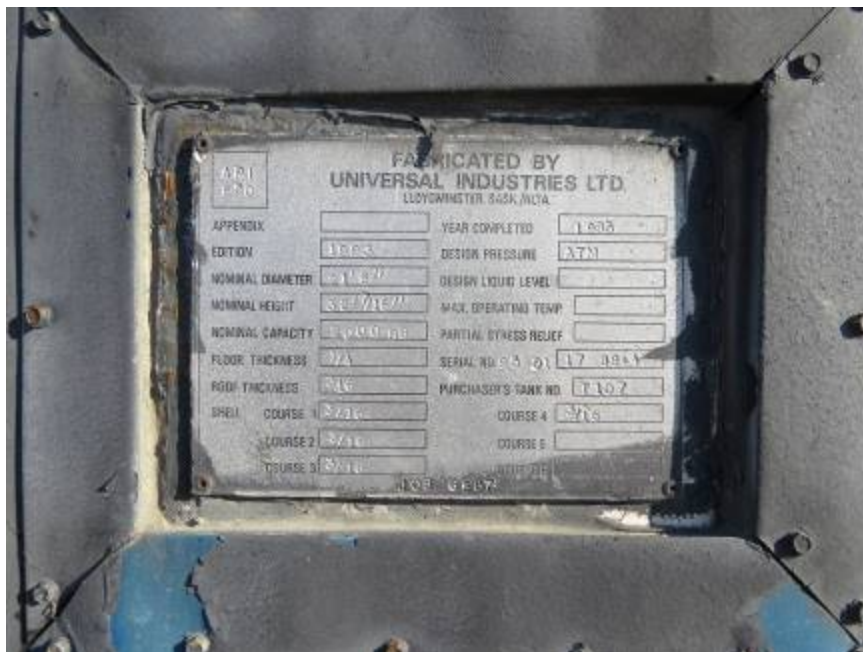
Photograph #2: Nameplate