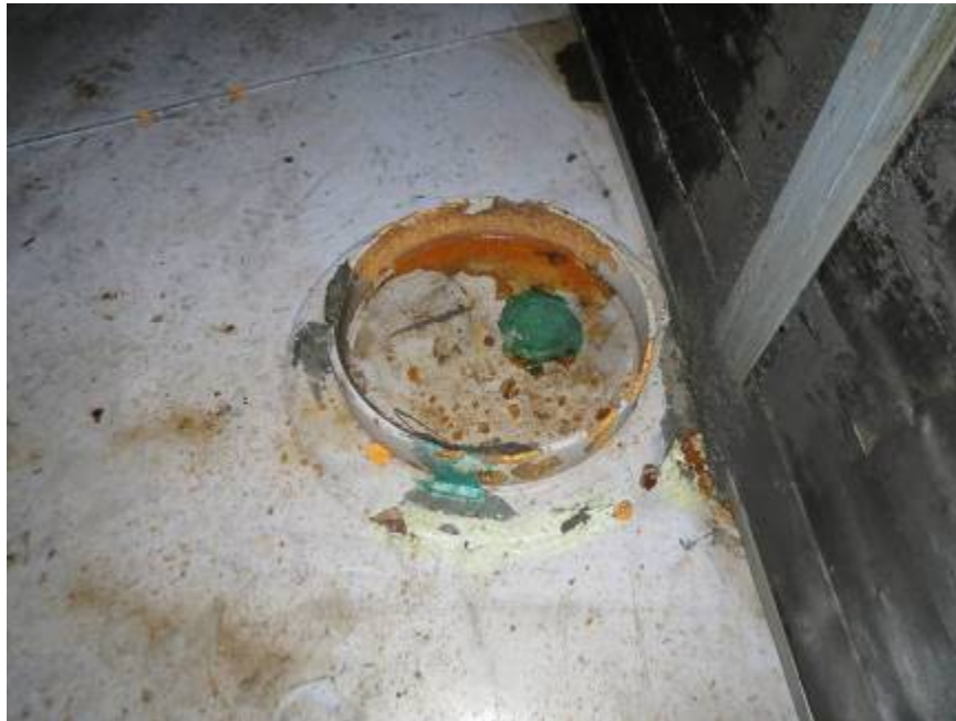
Photograph #8: Old Center Column