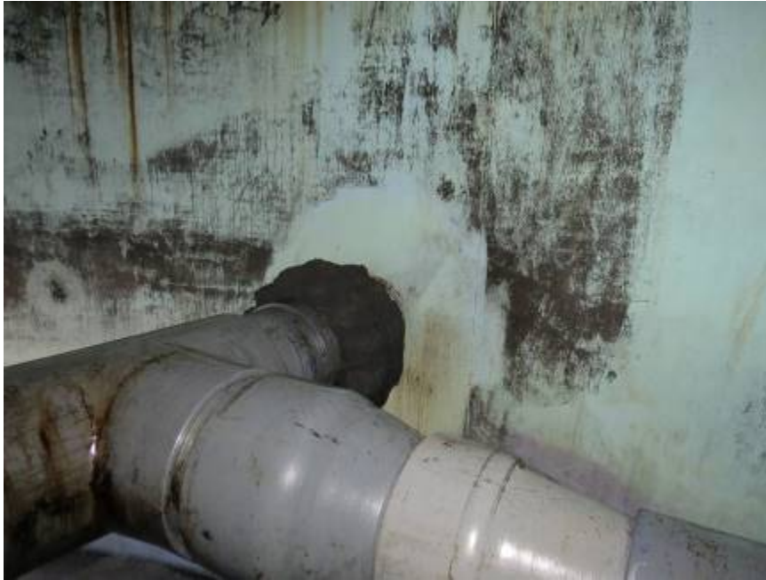
Photograph #34: Internal Nozzle