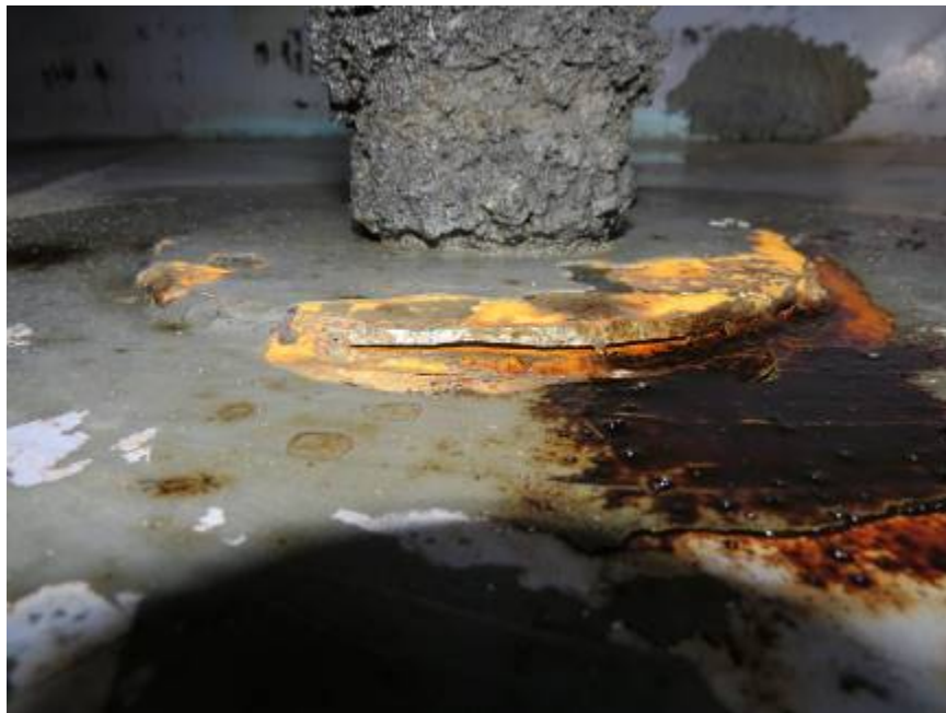
Photograph #37: Pipe Support Reinforcing Pad Corrosion