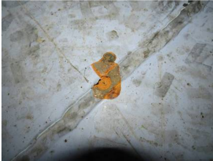
Photograph #12: Bottom Plate Weld Corrosion