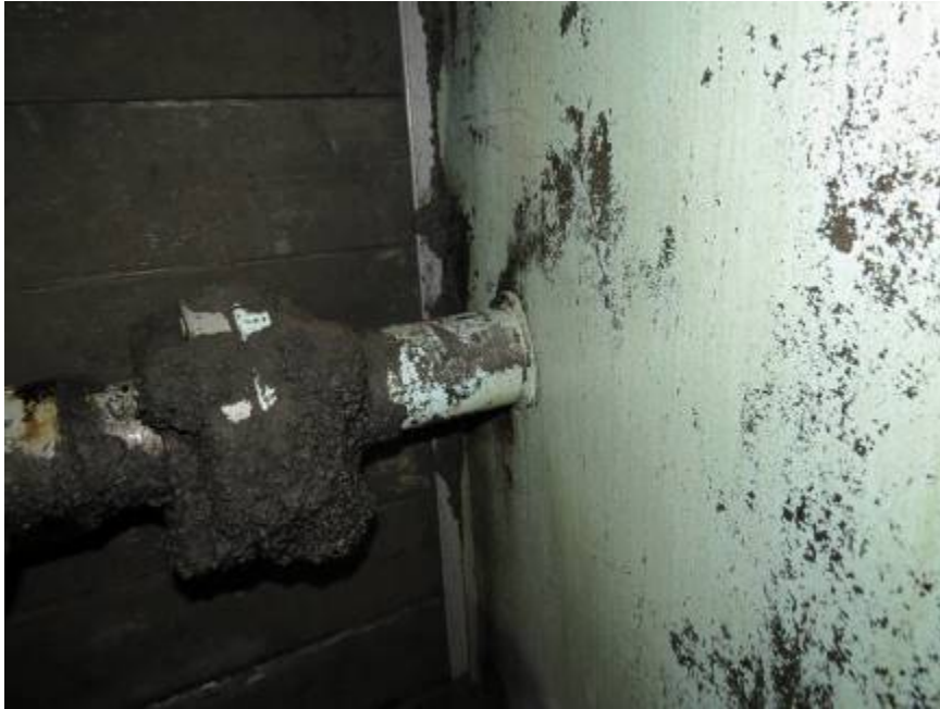
Photograph #30: Internal Nozzle