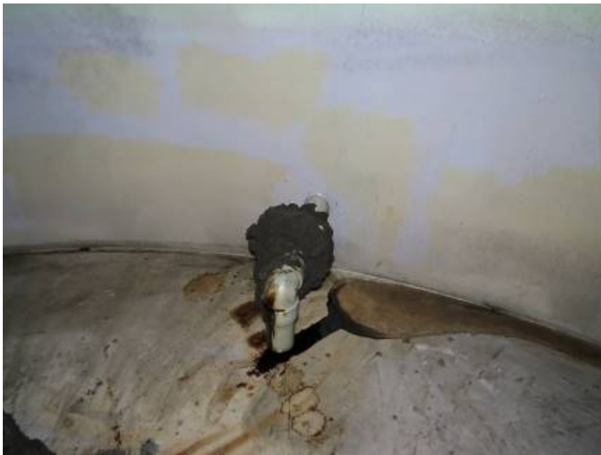
Photograph #33: Internal Nozzle