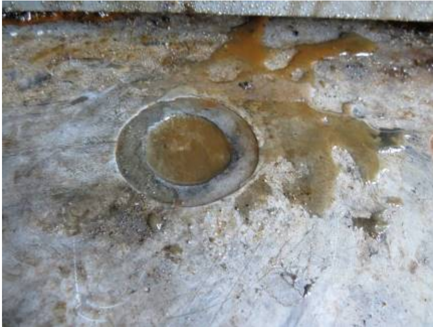
Photograph #10: Bottom Plate Pit