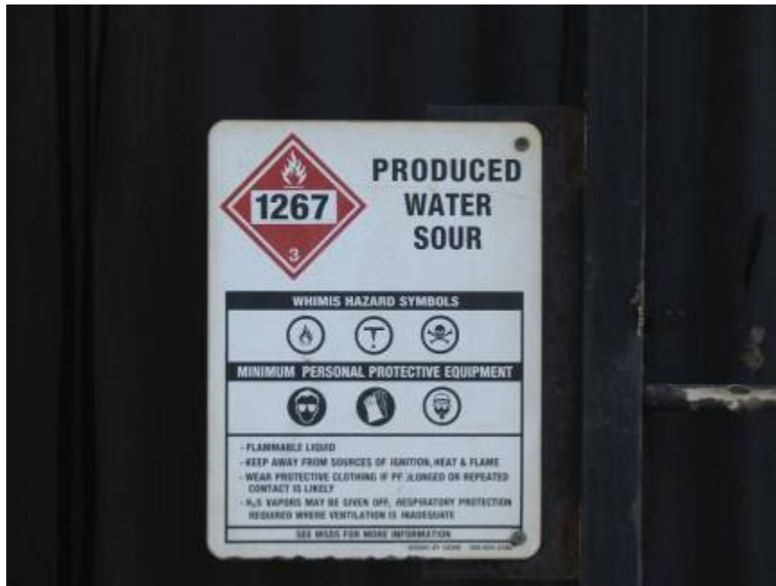
Photograph #3: Tank Product