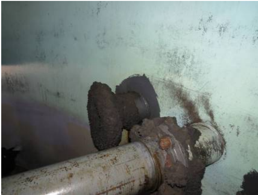
Photograph #32: Internal Nozzles