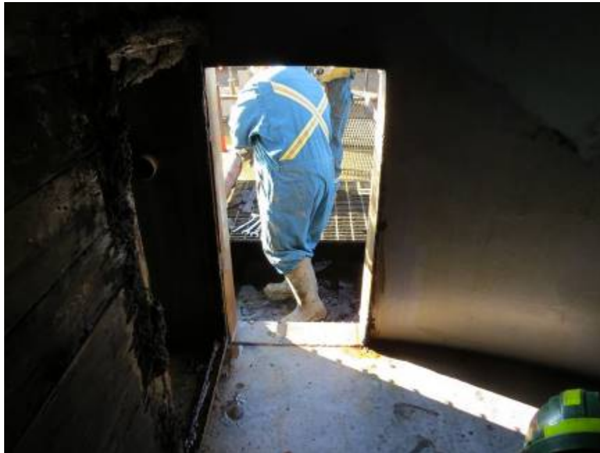
Photograph #26: Internal Manway