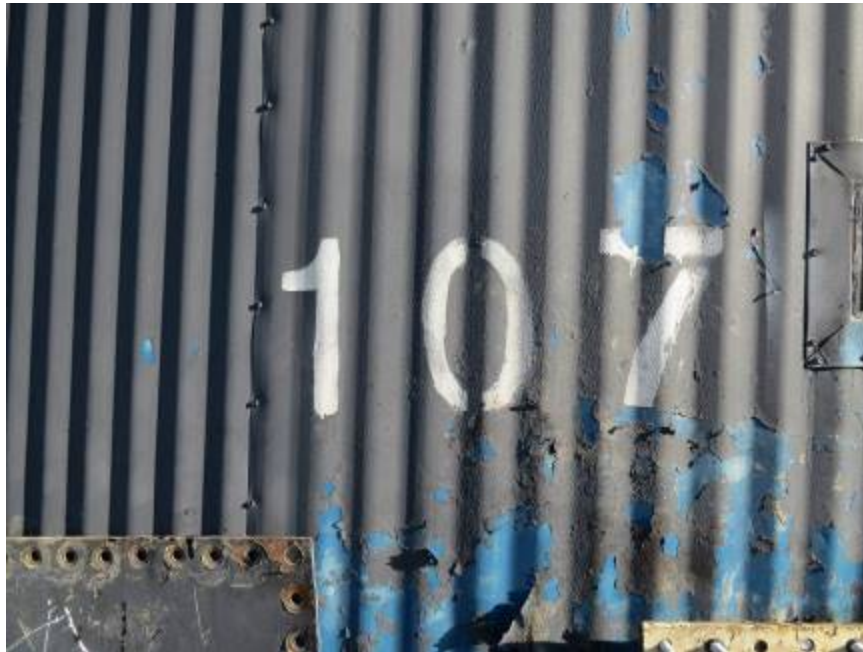
Photograph #1: Tank ID

The following digital photographs of the tank were taken at the period of this inspection: