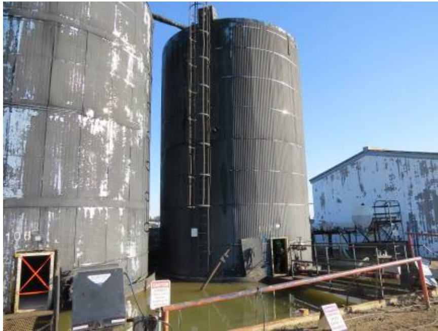
Photograph #5: Tank Overview