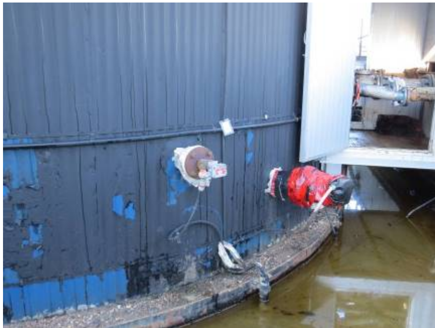
Photograph #23: Nozzles