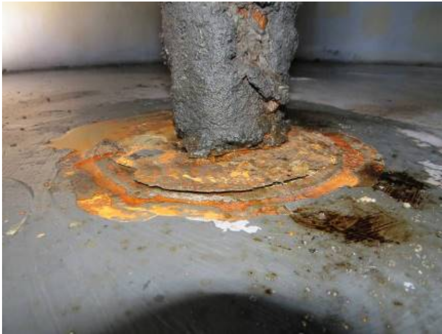
Photograph #35: Pipe Support Reinforcing Pad Corrosion