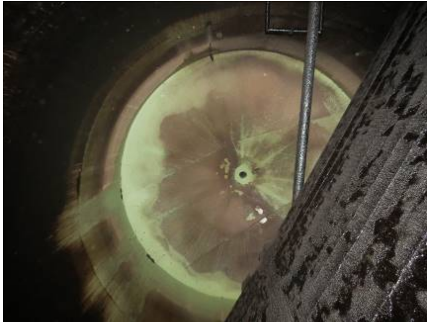
Photograph #38: Fixed Roof Overview

The following digital photographs of the fixed roof were taken at the period of this inspection: