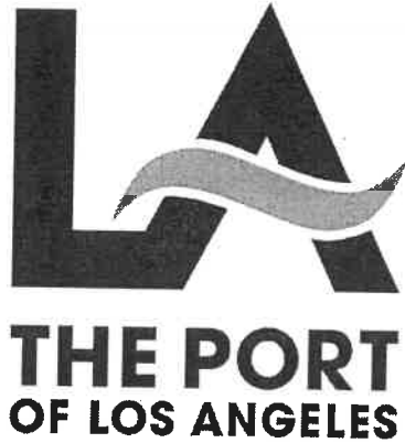
The Port of Los Angeles

The Southern California Academy of Sciences wishes to acknowledge the following organizations and people for their support of the 2009 Annual Meeting.