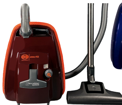
AIRBELT K2 Turbo Black Cherry with Turbo Head and Parquet Brush #9678AM