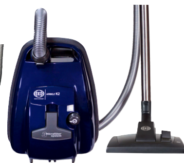
AIRBELT K2 Kombi Dark Blue with Combination Nozzle #9679AM