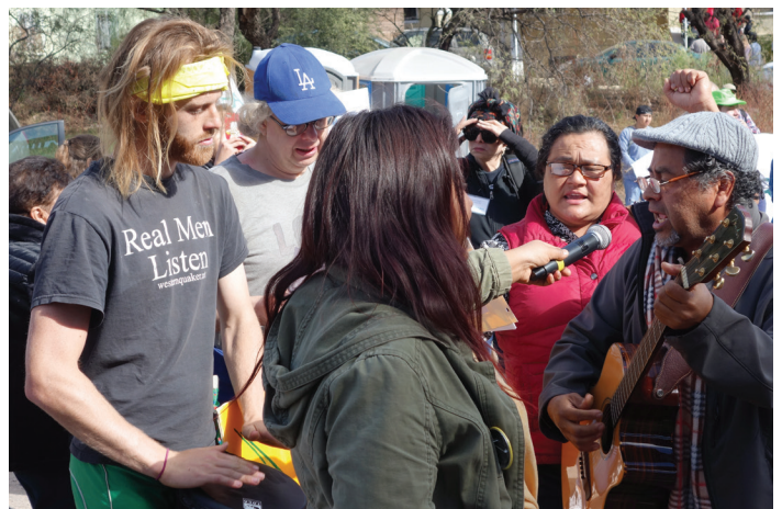
Photos: Friends and friends at the U.S.-Mexico border, November, 2018.