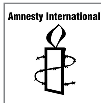
Image of Eric Baker’s press card (to serve as a correspondent for The Friend, 1958) from the Special Collections at the University of Bradford; images of Faroe Island stamps honoring the founding of Amnesty International are in the public domain; image of the Amnesty International logo is in the public domain.