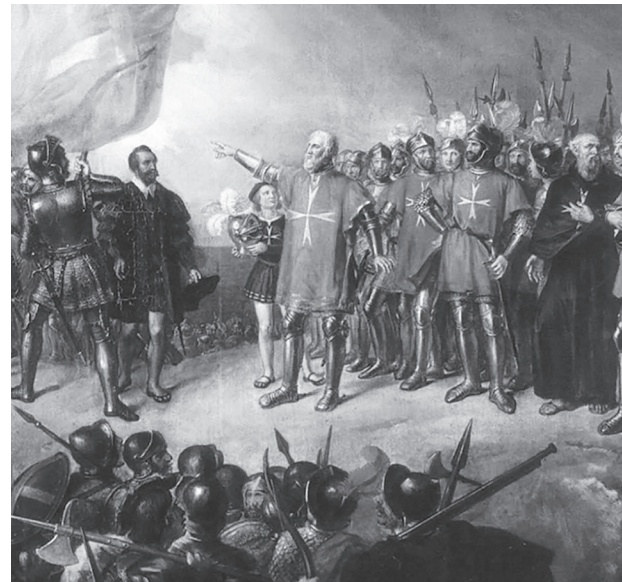
The picture of early Quakers in worship was painted by Joseph Walter West in the early 1900s. The picture of Catholic soldiers taking possession of Malta in 1530 was painted by René Théodore Bertion in 1839. Both are in the public domain.